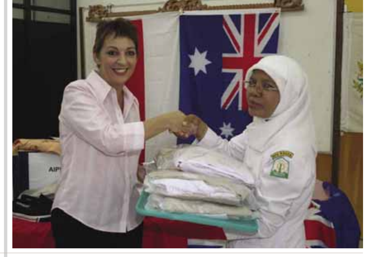
Australia has provided 1300 nurses uniforms and 1000 pairs of shoes for staff in two hospitals and three health academies in Aceh and Meulaboh. Manufacture of the clothing provided employment for local businesses.