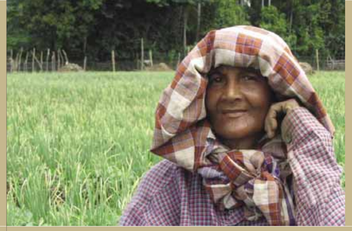
Australia's funding helped farmers get back on their feet after the tsunami, with seed for crops and other support. AusAID is also helping to restore shrimp hatcheries and fisheries, rebuild markets and address salination caused by the tsunami.

Over 150 staff, mostly Acehnese, are working with local communities to support these processes and deliver practical reconstruction programs.