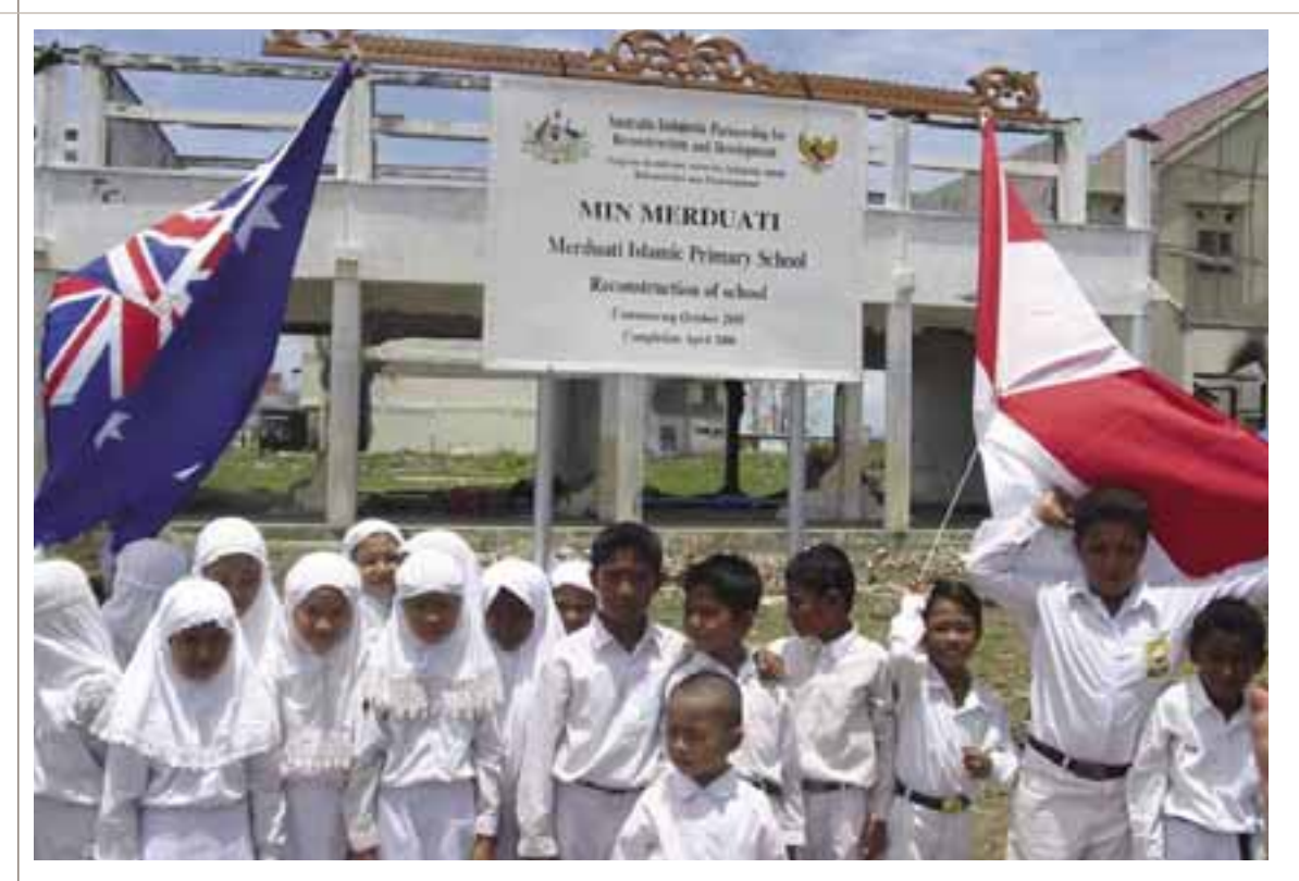
The launch of construction at Min Merduati primary school, where three out of four students perished in the tsunami.

Australia is providing significant support to the Islamic education sub-sector which educates approximately 50 per cent of students, many of whom are very poor. In this sector 21 per cent of classrooms were destroyed or damaged. Often religious boarding schools provide the only accommodation for children who were left homeless or orphaned, or whose families