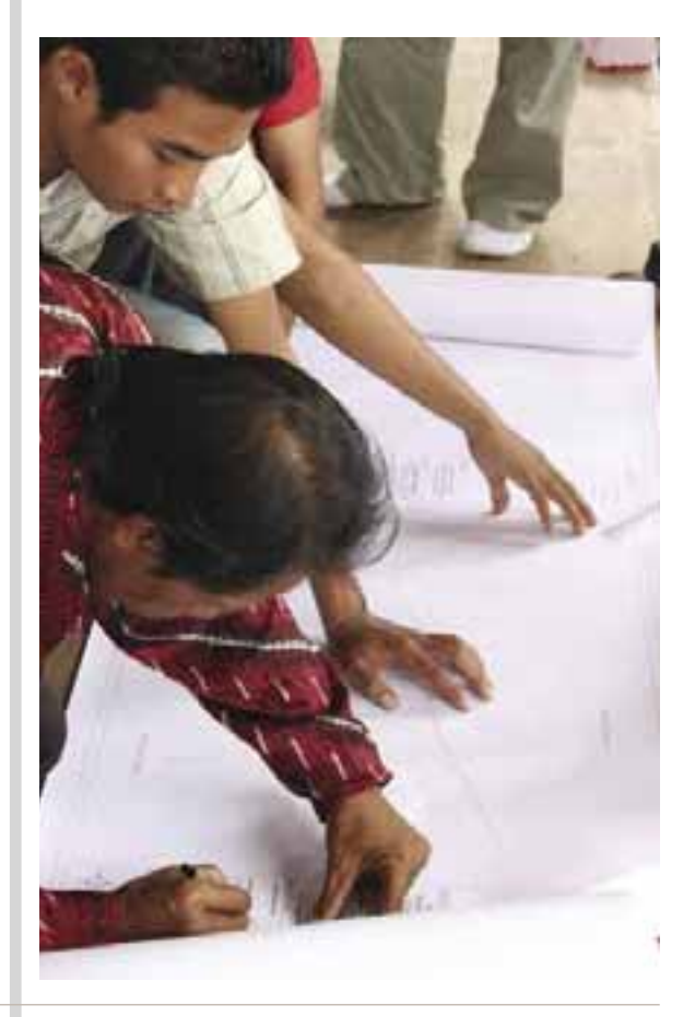
Extensive consultation with communities is required to re-establish property boundaries destroyed by the disaster.