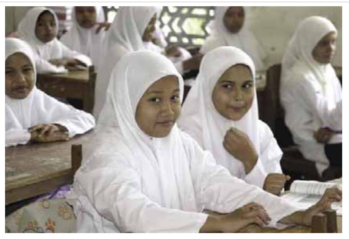
A temporary school in the basement of the Grand Mosque, Banda Aceh. The Partnership has provided grants for school construction works, procurement of teaching supplies and equipment.

A program to re-establish the Research and Training Institute at Syiah Kuala University in Banda Aceh has been designed and will support research into the effects of the tsunami and reconstruction efforts in Aceh. In addition, 33 post-graduate scholarships for study in Australia have been awarded to Acehnese students in the first intake of 370 Australian Partnership Scholarships.