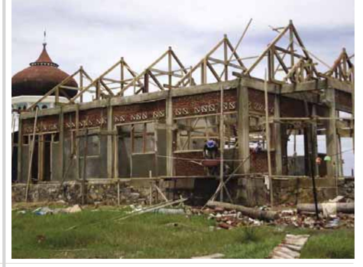
The centre of village life -180 community halls are being built with funding and technical expertise provided by Australia.