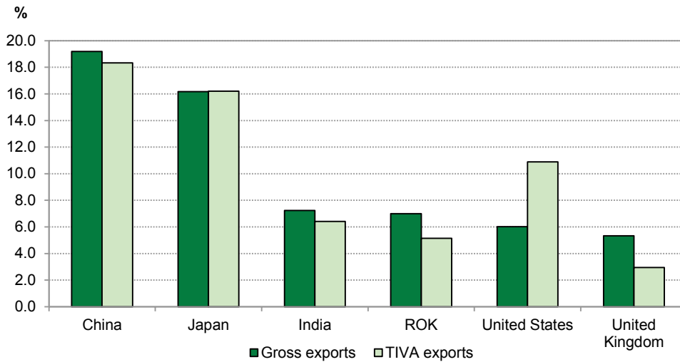
Chart 1 – Share of TIVA vs gross exports, 2009