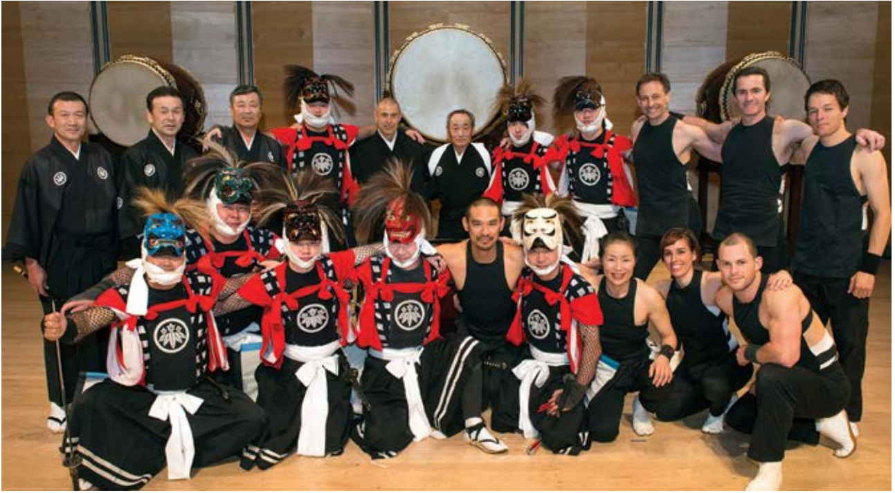
Australia's Taikoz with the Iwasaki Onikenbai Hozonkai dancers and musicians from Iwate Prefecture, on stage at City Recital Hall Angel Place (Sydney) on 28 November 2013.