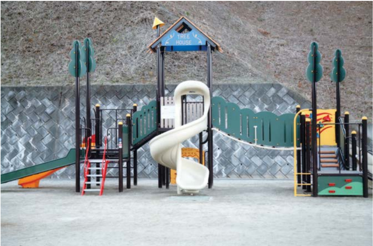
Opening of the playground at Iitate in 2012.