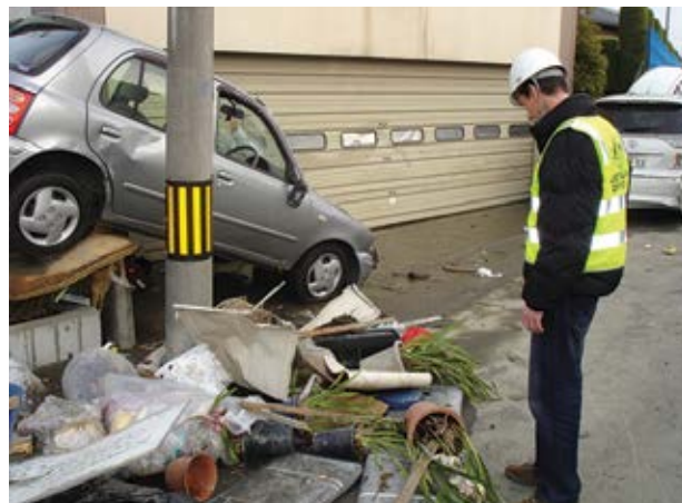
One of the team members of an Australian-led DFAT consular relief team that worked on the ground at evacuation centres in the earthquake and tsunami devastated regions of Miyagi Prefecture.

The Japanese Government estimated the economic cost was approximately US$300 billion, making this the costliest natural disaster in world history.