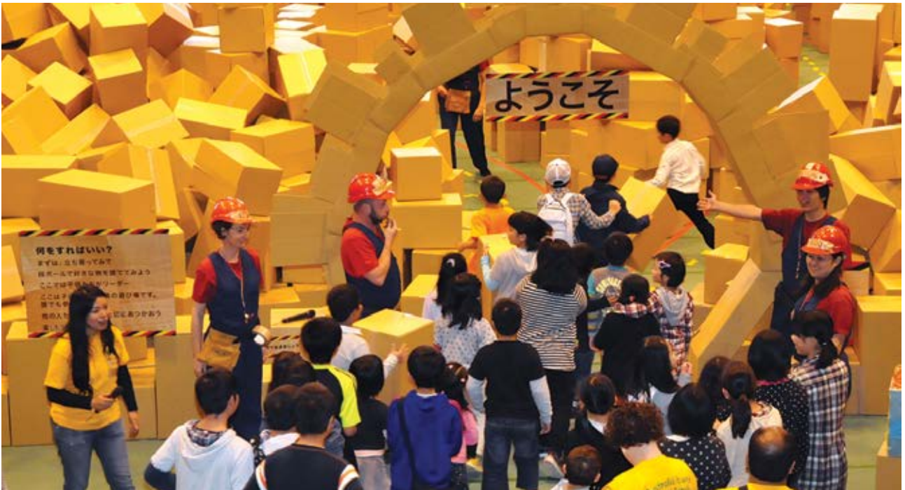
The Polyglot team with parents and children of Minami Sanriku.