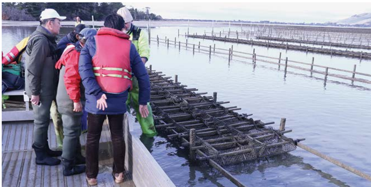
Members of the Momonoura community discuss Tasmanian oyster farming techniques.