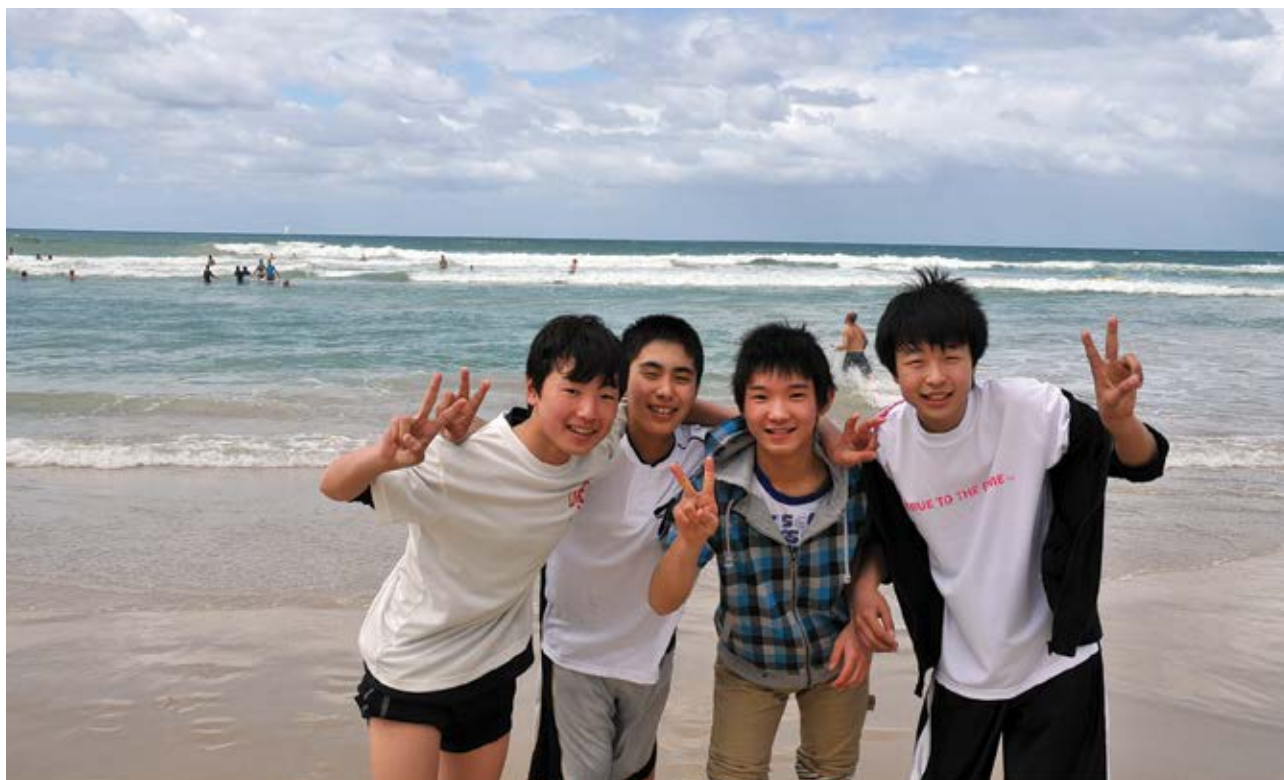
First exchange of children from Minami Sanriku to Helensvale State High School Queensland—saying goodbye.