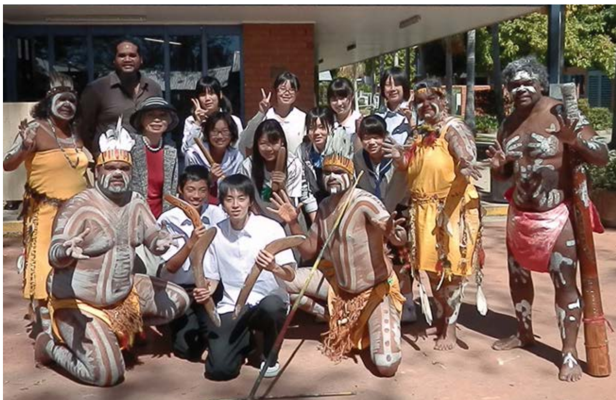
The [Townsville] Kizuna Youth Project for Iwaki students after the Great East Japan Earthquake. Students from Iwaki with the Whantanah-Jaban Aboriginal Traditional Dance Group at the Cathedral School, August 2012.

The respite, even though short lived, helped the students see a world outside the daily problems they faced in Fukushima. It helped build a spirit of optimism and an understanding of the value of international relations. Many established contacts and friendships that will continue for years to come.