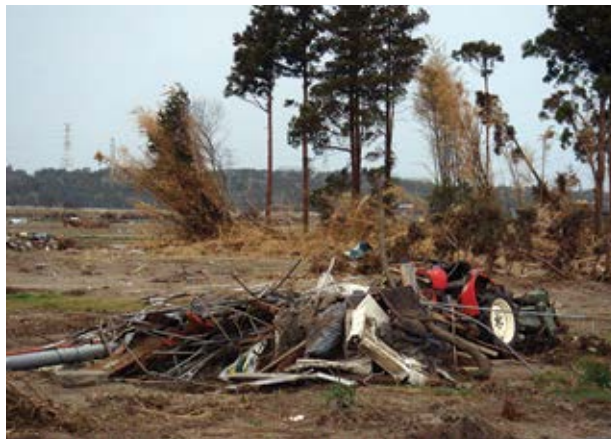
Above and below: Scenes from Fukushima—after the triple disaster of 11 March 2011.

It is a tribute to the strong people-to-people links between the two countries that Australia continues to provide support to Tohoku. Australians remain deeply moved by the dignity and determination demonstrated by the Japanese people as they continue to rebuild their lives.