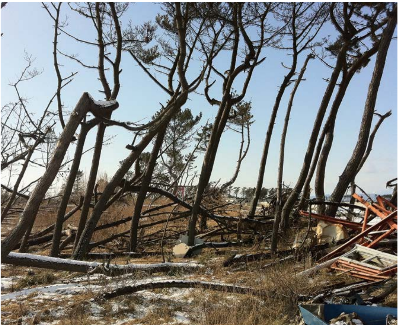
Contemplating the terrible destruction wrought to the Sendai foreshore by the tsunami of 11 March 2011.

Publication of the important scientific outcomes has also been made possible as part of AJF grant funding.