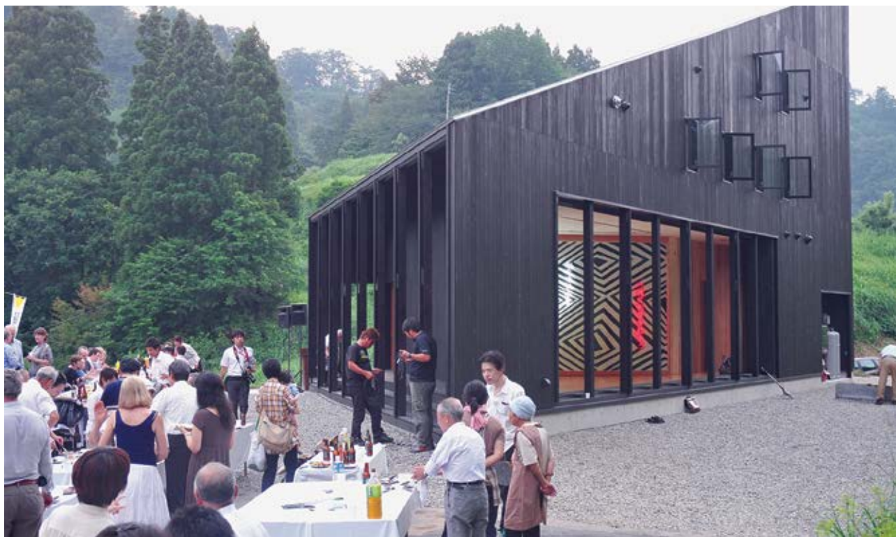
Official opening of the New Australia House in 2012.

Today, Australia House is once more a thriving centre and it reflects a merging of Japanese and Australian culture. The centre includes galleries, a workshop and a residential space for Australian artists. It also showcases collaborative projects between Japanese and Australians.