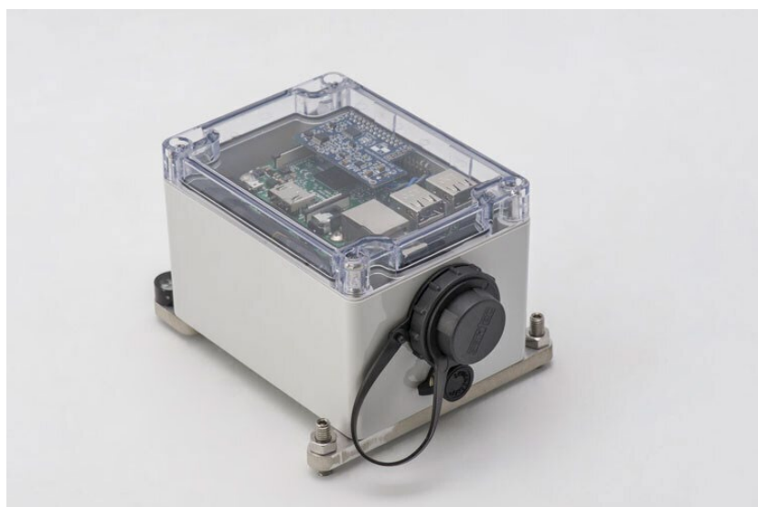
Figure 1. The Raspberry Shake 4D device currently deployed at RVO. Each unit costs approximately $2000 (compared to $60,000 for traditional seismic sensors – from 2018 GA report).

The main focus of the technical equipment to deliver this outcome is a low-cost seismic monitoring equipment with the brand name "Raspberry Shake". These were initially expected to be used as rapid deployment kits for under-monitored volcanoes that were showing signs of unrest. Trials of the new generation Raspberry Shake 4D sensors in 2018 found them to be effective units and they were then rolled out more widely as part of a Community-Based Seismic Network (CBSN). These are currently installed in international schools in New Britain and at UPNG and future installations will include government buildings in Bougainville.