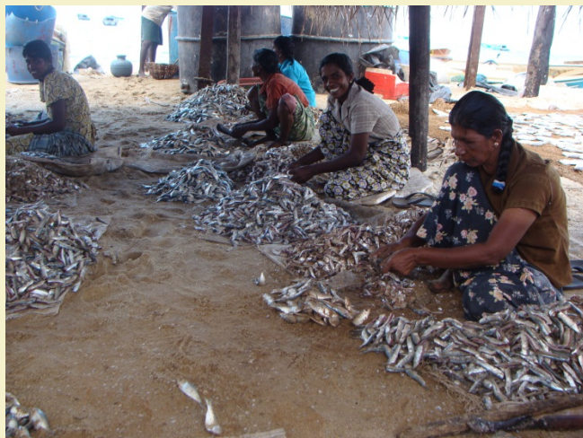
Workers sorting dried fish.

The Mathagal fishing community in the Jaffna District, Northern Province, has experienced displacement multiple times due to the long-term conflict. Fishing, a major part of the local economy, has often been disrupted by the conflict. This has resulted in loss of assets and under-investment in infrastructure, meaning many fishermen catch less fish and earn less for the haul they have.