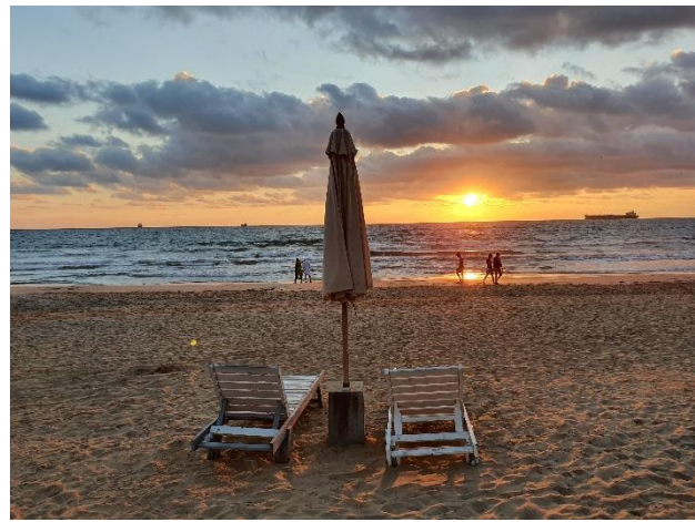
A beautiful sunset in Trincomalee during the 'off' season.

approaches expanded in the future to other districts and sectors , e.g. Information and Communications Technology (ICT). In addition, the MSDVT Secretary is a member of the S4IG Strategic Advisory Group. While there is strong appreciation of S4IG at senior levels of the MSDVT, there remains a view that there is room for greater coordination in the future. Areas that could be improved include greater levels of advocacy and cooperation with public sector agencies (National Apprenticeship and Industry Training Authority, Vocational Training Authority and public providers in particular) in the roll out of the national NVQ system.