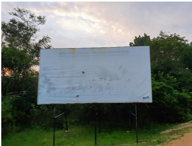
A faded EPTB billboard near Kumana National Park that once marketed the destination.

At the national level, within senior levels of the MSDVT there is strong awareness of S4IG program activities and an expressed wish to see S4IG