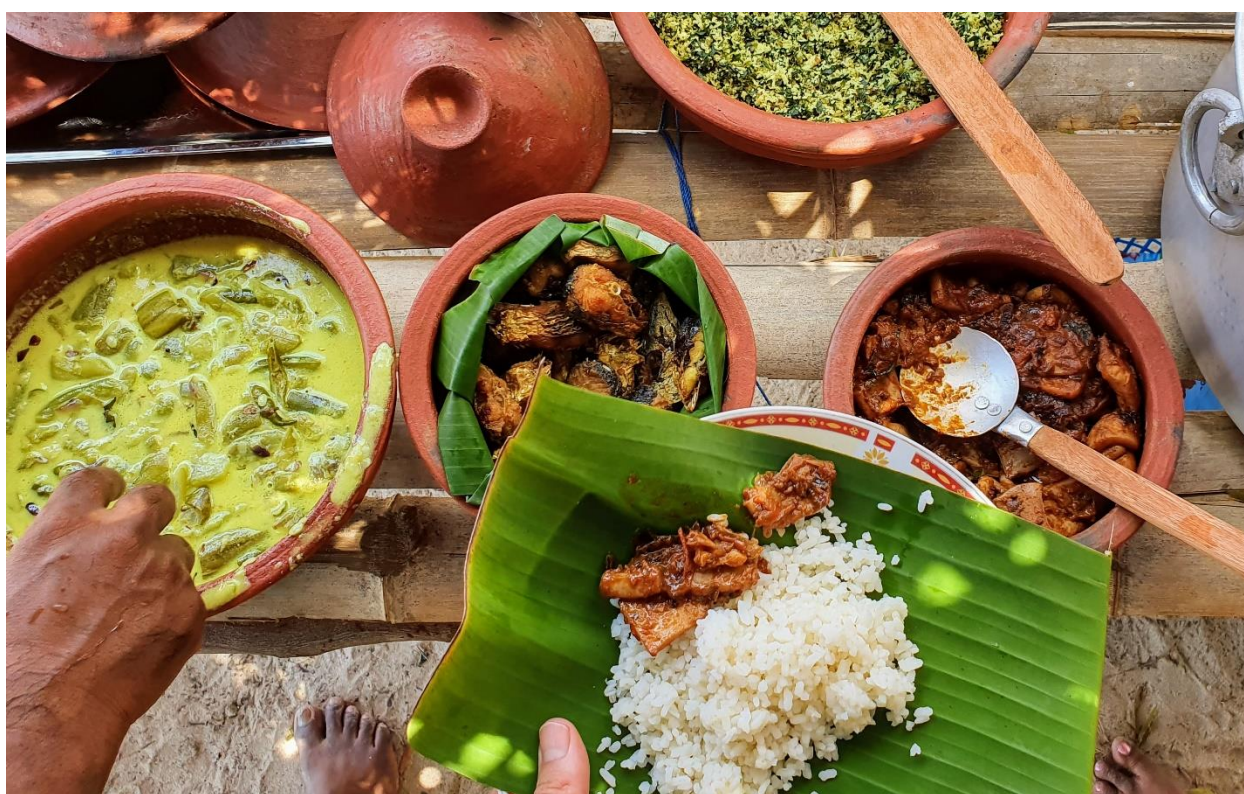
Local food prepared by a fishing community in Batticaloa.

This review plan is based on the terms of reference developed by the Australian High Commission with consultation of the Sri Lanka Support Unit. The general purpose of the review is to assess the program and provide recommendations that will guide DFAT's decisions on continuing to invest in a program supporting inclusive economic growth through skills development in Sri Lanka, for an additional phase of 4 -6 years. The focus of the review will be DFAT's S4IG program, implemented by Scope Global Pty Ltd. The management of the review will be led by the Sri Lanka Support Unit (SLSU).