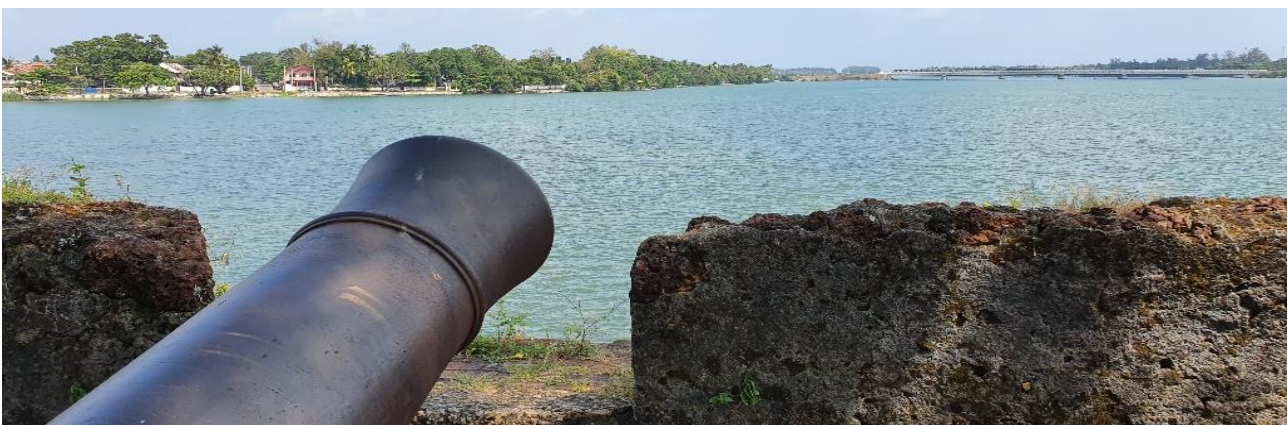
The Dutch Fort in Batticaloa has the only working cannon left in Sri Lanka, and is undergoing a major renovation and transformation to become an ‘anchor’ for local tourism

Clarify a truly inclusive approach and the concepts around empowerment through capacity building of the S4IG team. Programmatically, transformational work should be done with families / partners to ensure they understand the nature of the advantage. S4IG can have better follow up of the participant experience over time to capture advancement, transformation and genuine empowerment. Practically there is a need for hotels to have greater engagement with employee safety, accessibility and workplace satisfaction (e.g. safe place mapping, accessible workplace as well as front-of-house, worker transport, family friendly shifts, flexible work). As part of the scaling, generate a business case and associated communications for inclusion targeted to employers. The MEL and specifically the disaggregation of data should be reviewed in light of the inclusion strategy, considering all factors of exclusion.