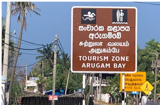
Arugam Bay is a tourism hotspot, particularly for tourists, with over 150 hotels and guesthouses