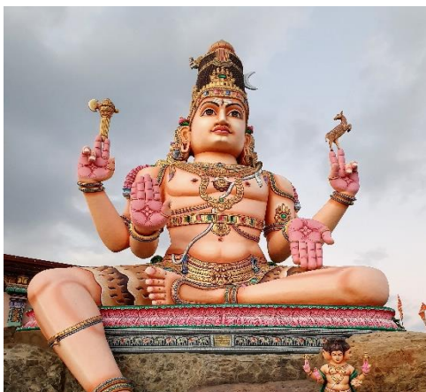
Shiva at the popular Koneswaram Hindu temple in Trincomalee

Moving forward, the emphasis on sustainability is going to be increasingly important. For the success of S4IG based on the design intentions and the End of Program Outcomes, greater levels of sustainability and in particular local ownership (scaling up) will be essential. Some risks to this remain – particularly the challenging political economy and the timeframes and investment required to reform entrenched supply driven TVET systems. The review team observed that the S4IG team are adequately managing these risks within their sphere of influence.