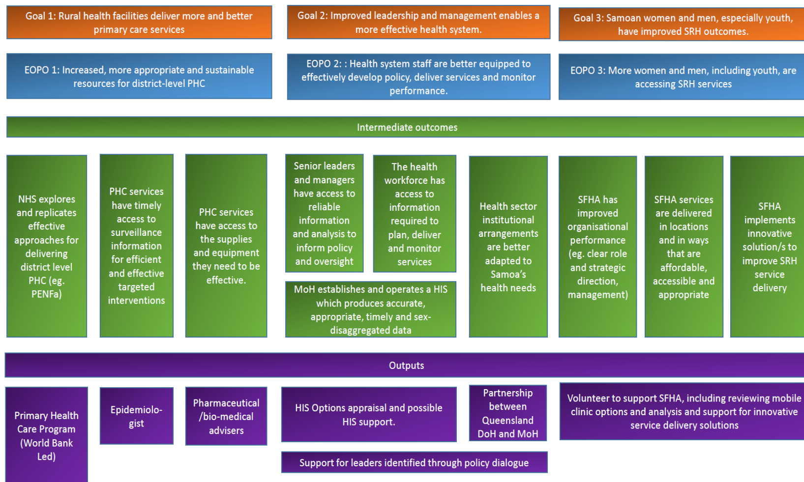
Figure 1: Program logic