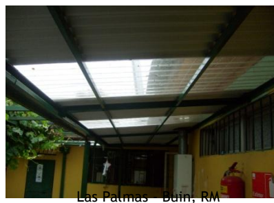
Las Palmas - Buin, RM