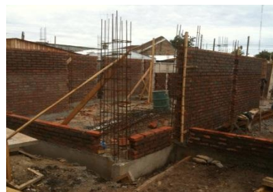
Abejitas – San Clemente, Del Maule