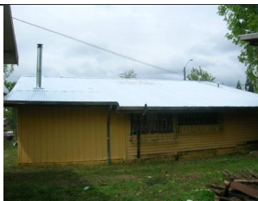
Cepillín - Ercilla, Araucanía