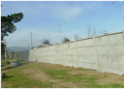
San Enrique - María Pinto, RM