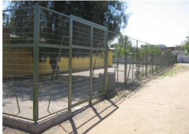
Valle de Azapa - Renca, RM