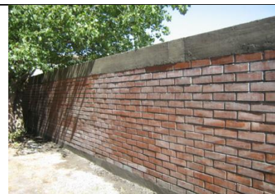
San Fco. Del Monte - El Monte, RM