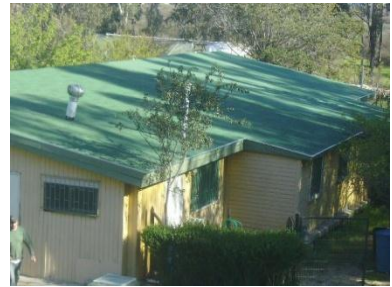
Los Pelluquitos - San Pedro, RM