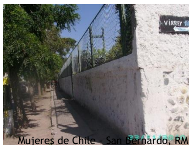
Mujeres de Chile - San Bernardo, RM