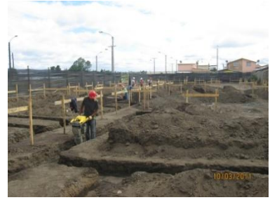
Los Ciervitos – Gorbea, Araucanía