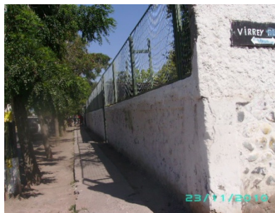
Mujeres de Chile - San Bernardo, RM