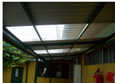
Las Palmas - Buin, RM