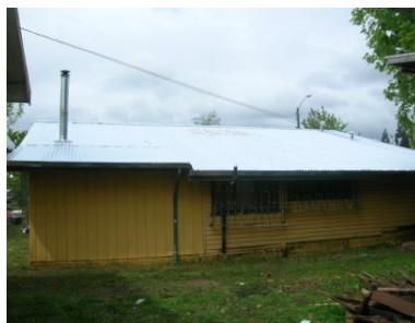
Cepillín - Ercilla, Araucanía