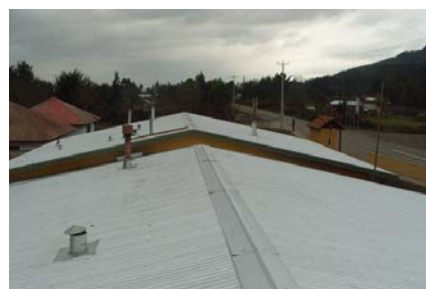
Huentelolen - Cañete, Del BioBio