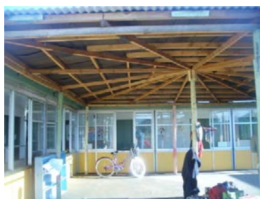
Niditos del Valle - Linares, Del Maule