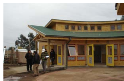
Copito de Nieve – Vilcún, Araucanía