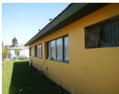
Pepelucho - Licantén, Del Maule