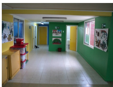
Los Aromos - Concepción, Del BioBio