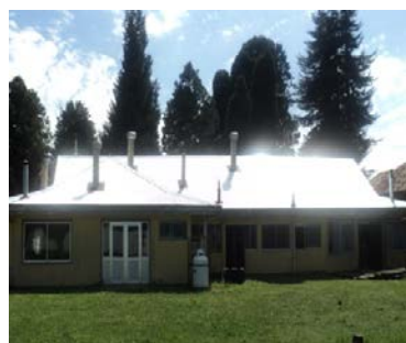
Los Notros - Freire, Araucanía