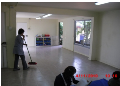
Rinconcito Mágico - Pudahuel, RM