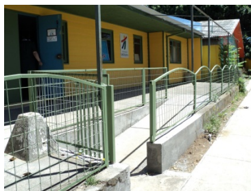
Rayo de Luna - Yungay, Del BioBio