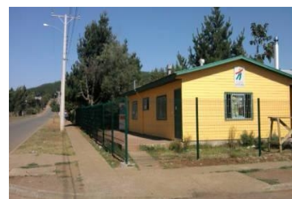
Los Castorcitos- Coihueco, Del BioBio