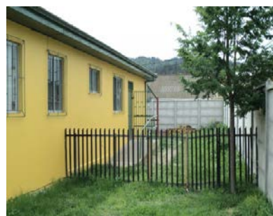
S.C Capullito - Licantén, Del Maule