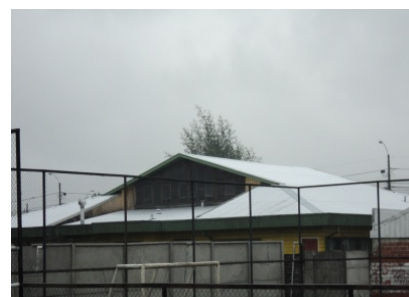
Villa Austral - Temuco, Araucanía