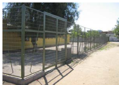
Valle de Azapa - Renca, RM