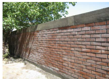
San Fco. Del Monte - El Monte, RM