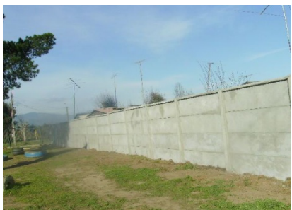
San Enrique - María Pinto, RM