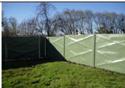
Flor de Aromo, Maule, Del Maule