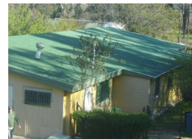
Los Pelluquitos - San Pedro, RM