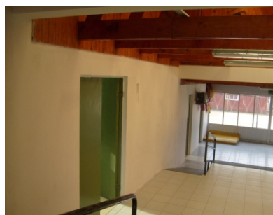
Semillita - Cauquenes, Del Maule