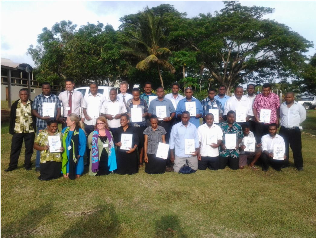
Vanuatu Law and Justice Partnership Stretem Rod Blong Jastis part of Policing and Justice Support Program (Vanuatu)