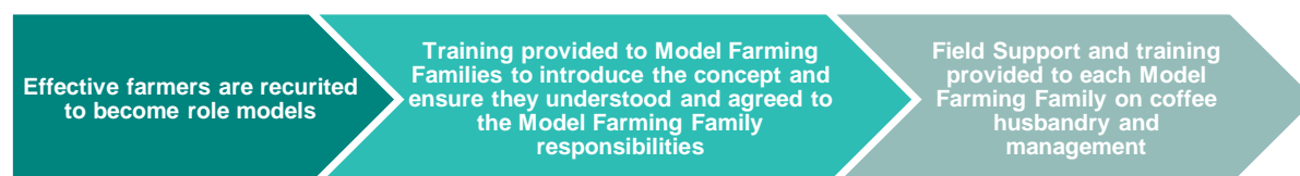
Figure 2 Model Farming Families process

Figure 2 shows the process for working with Model Farming Families.