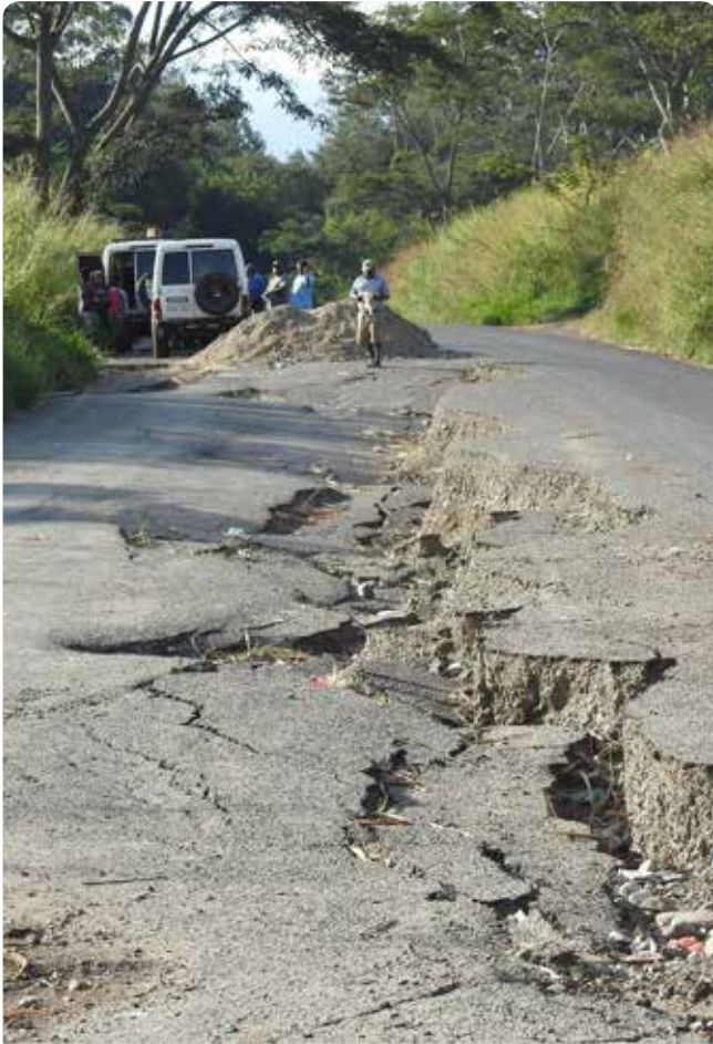
Highlands Highway near Goroka. Much of the national road network is in a poor condition. Sections of road like this one are not uncommon.