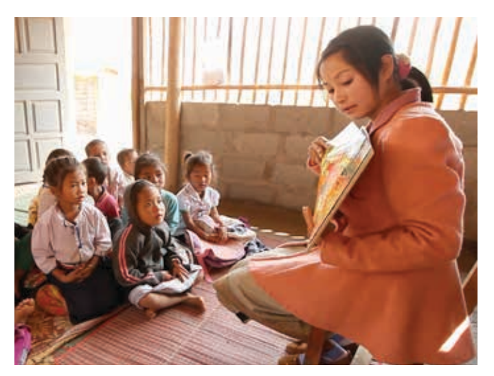
Global Partnership for Education teacher in a classroom in Laos.

the 'missing middle' i.e. enable subnational education personnel to translate national teacher development improvements into effective school-level teacher management and support. A promising solution is to recruit and train provincial and district officers, district supervisors and principals as educational professionals. They can then be employed to support, mentor and monitor teachers in improving education quality and pupils' learning outcomes.