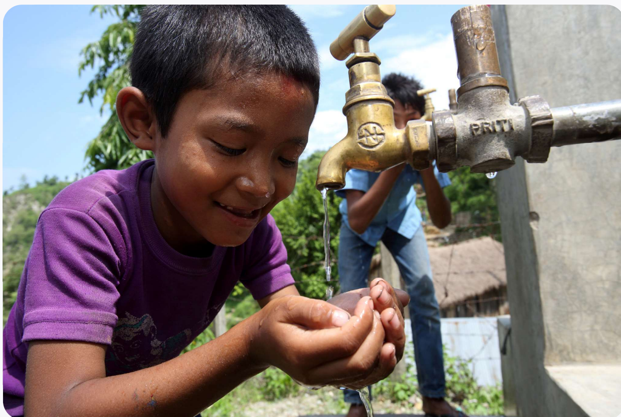
Boy with access to drinking water in Nepal, 2013.