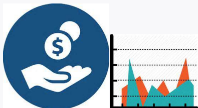
Figure 2: Recommendations