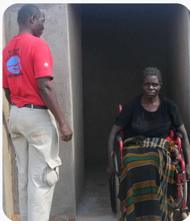
New toilets built to accommodate people using wheelchairs, 2011.