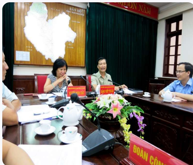
Strengthening the WASH enabling environment: Thrive Networks working in partnership with the Vietnamese government. Civil Society WASH Fund, 2014.

Based on these findings, ODE made six recommendations to improve the management of the Fund and, especially, to inform the design of the Water for Women initiative. These recommendations are summarised at Figure 2 .