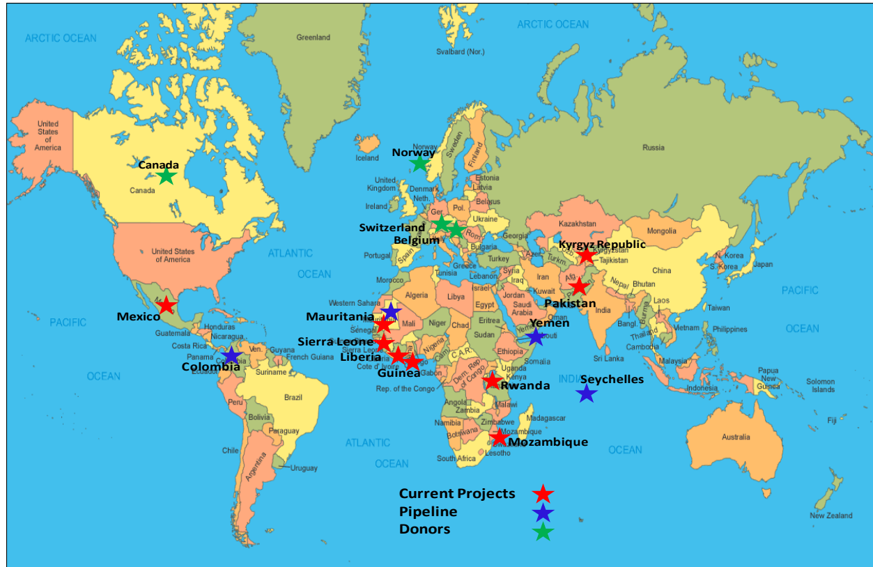
Figure 1: Global Map of EI-TAF Activities