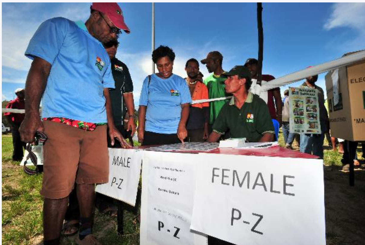
Electoral Commission workers explain separate voting for women and men at a practice poll booth in Port Moresby for Papua New Guinea's 2012 elections.

care is required in design, training and delivery of these programs, combined with a focus on longer-term capacity building, independent of—though coordinated with—the electoral cycle. 74