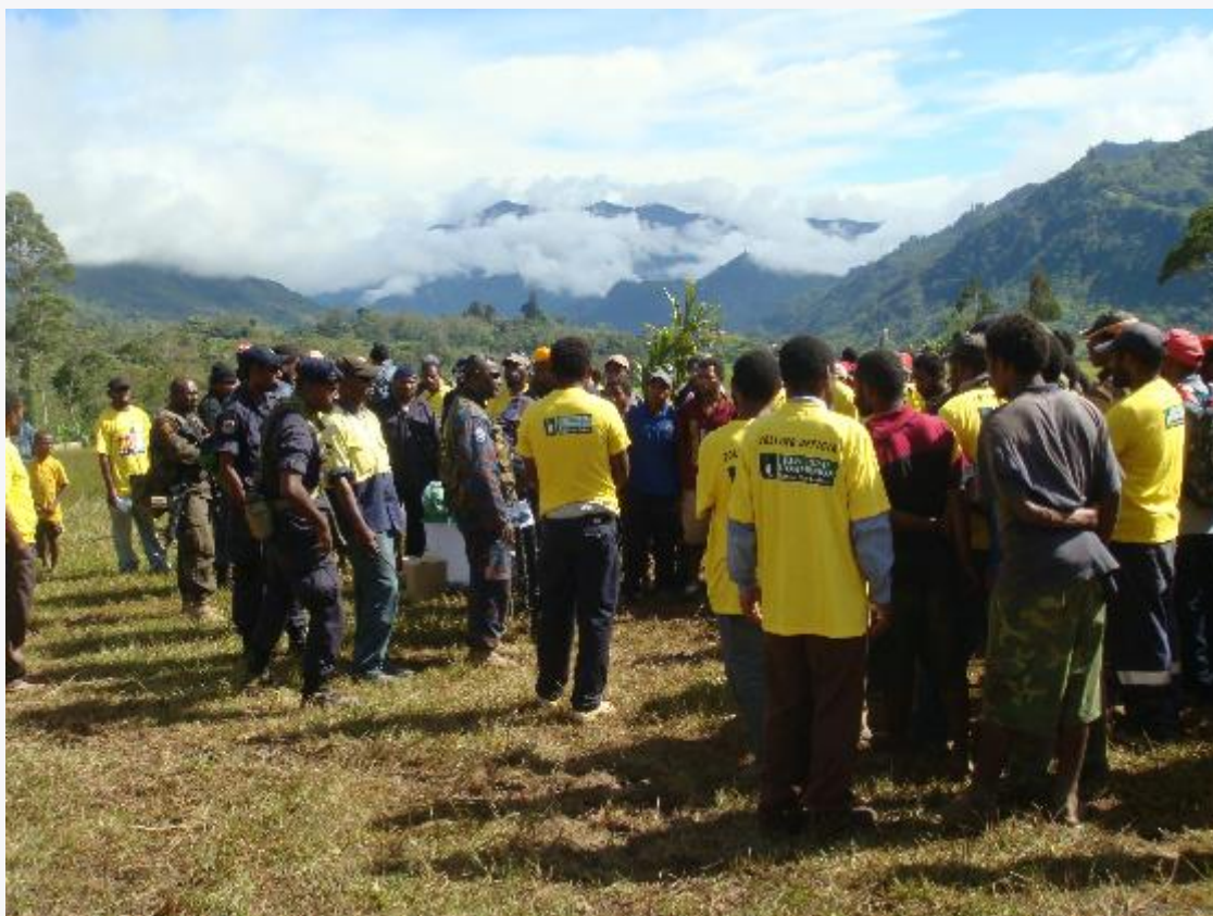
Voters and officials in the Highlands of Papua New Guinea, July 2012.