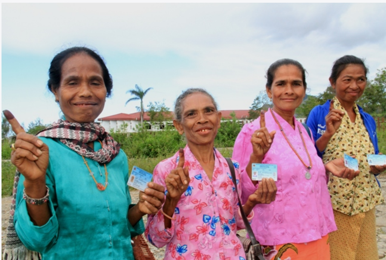
Women in Ainaro participate in the second round of presidential elections in Timor-Leste, on 16 April 2012.

To enable such analysis, DFAT must ensure evaluation of the major elements of support (such as voter registration, strengthening EMBs, voter awareness) is built into the design of that assistance. Such learning could inform the design of future electoral assistance, and the decisions of electoral stakeholders in the region.