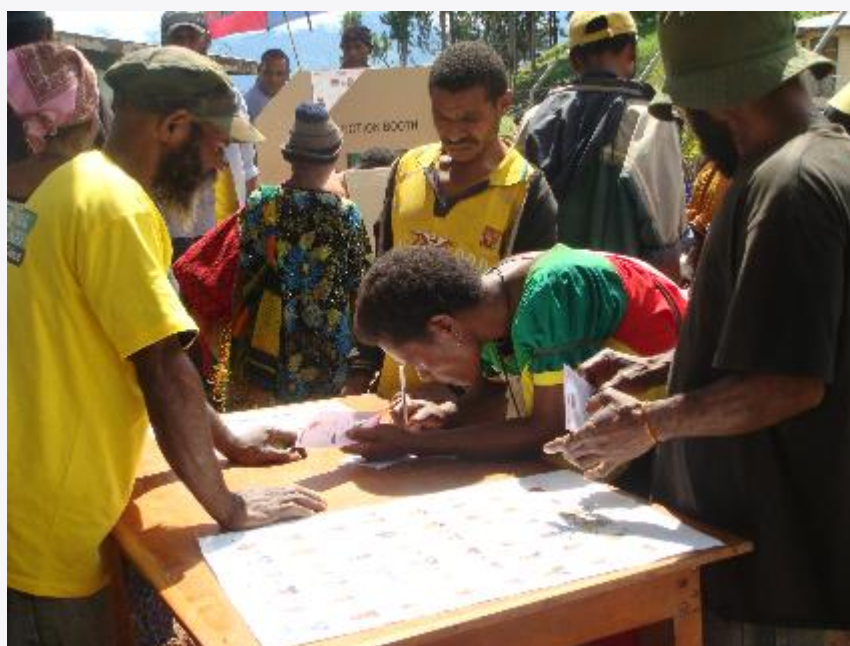
A voter in the Highlands marks her ballot during Papua New Guinea's 2012 elections.

The degree of social inclusion varies across the study countries but all present challenging environments. Around the world, electoral processes remain predominantly exclusive to well-educated, financially solvent, able-bodied, racially dominant, heterosexual men. In large part, this is because financial, structural and attitudinal barriers exist to the participation of 'others' in public life. Importantly, and as noted in Boxes 1–3 below, these barriers are not the same for each marginalised group. In an electoral context, inclusion means realising political rights guaranteed in the relevant human rights instruments.