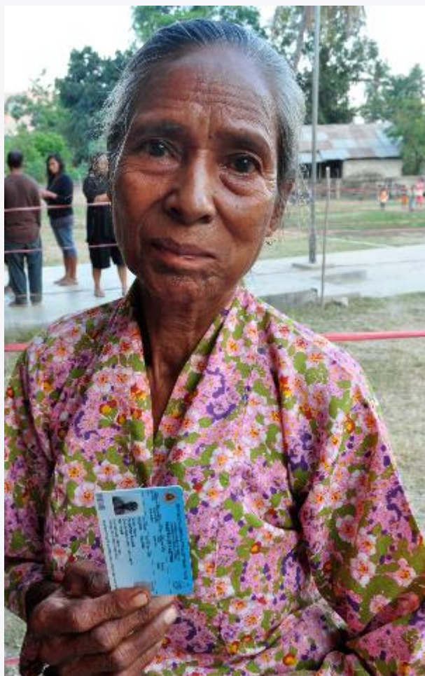
A woman with her registration card is ready to vote in Timor-Leste's 2012 Parliamentary Election.

For some programs, initial implementation delays limited the activities possible immediately after the election and compressed assistance in the period leading up to the next. Programs that did provide assistance over a full cycle (or beyond) were predominantly centred on the electoral management body. Engagement with other actors, potentially better suited to address critical constraints at different points in the cycle, was not a strong feature of assistance. In Indonesia, the Electoral Support Program (2011–15) did broaden engagement beyond the electoral management body to include work with other actors on electoral integrity issues. The program was followed by a small Democratic Governance Support Fund to support civil society engagement on integrity issues, but it was discontinued after 12 months. 55