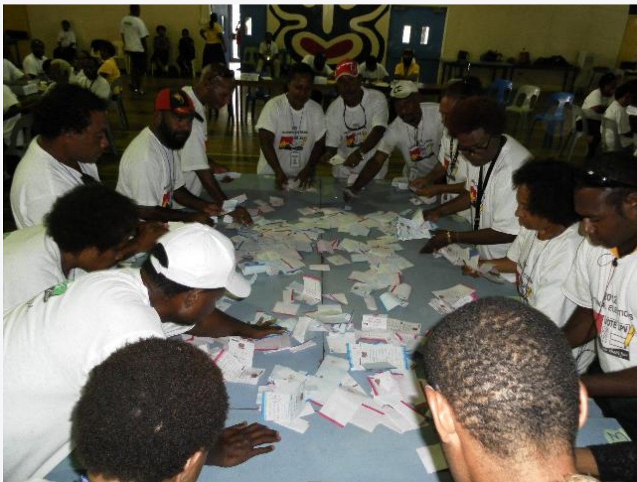
Vote-counting centre in Port Moresby, Papua New Guinea, 10 July 2012.

Support has been provided in a variety of forms: equipment and materials (including supply of IT and office infrastructure, materials and resources for training and publicity); funding operating costs (for awareness campaigns and programs, domestic election observers and for planning and logistics support); and technical assistance (for training, workshops, study tours, research/reviews and technical advisory support). Technical assistance has been a significant form of aid over the period, especially long-term and short-term personnel.