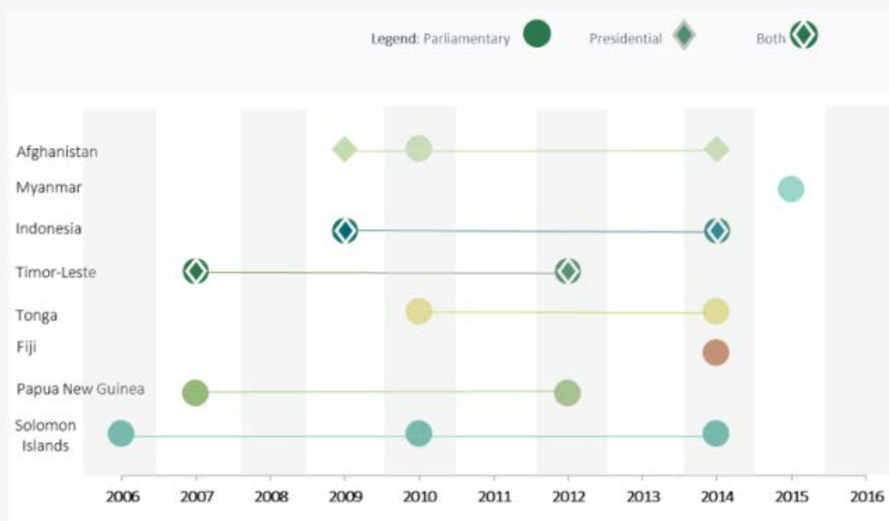
Figure 1: Major national elections covered by the evaluation

In examining Australia’s support for more inclusive elections, the evaluation focused specifically on gender and disability, but also considered inclusion of other important groups where relevant and feasible, including ethnic minorities.