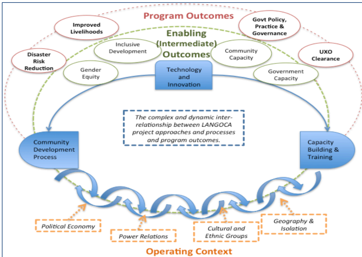
Figure 1: The Inter-relationships of LANGOCA elements and approaches