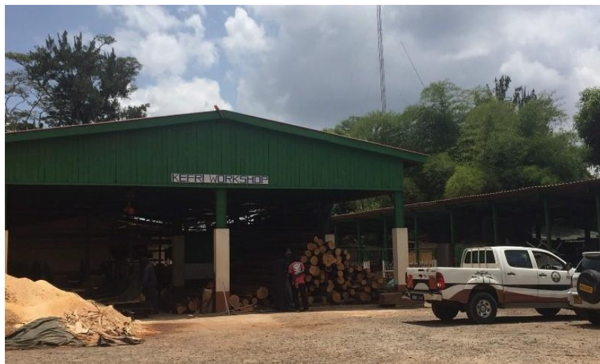
Figure 1 KEFRI wood science workshop, Nairobi

... the research activities, I undertook at Creswick [the School of Ecosystem and Forest Sciences at the University of Melbourne] ... These are some of the experiments I set up at the moment, I'm the one in charge of wood protection activities.