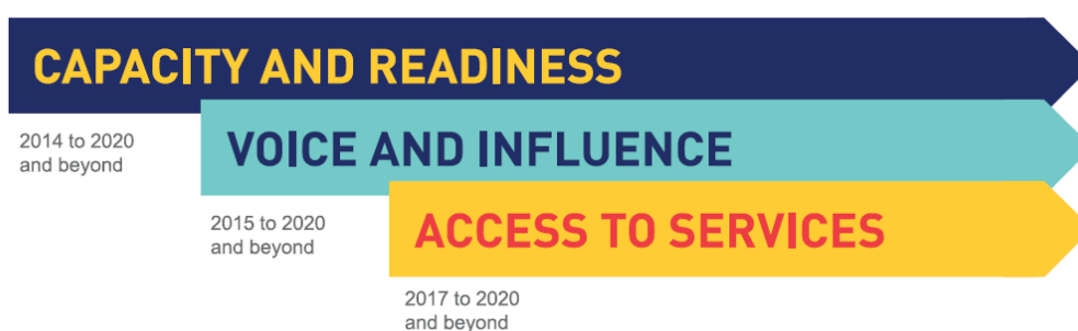
Figure 1. Theory of change: Outcomes by timeframe

The program entered into partnerships with a diverse range of CSO partners who brought with them a large number of local partners. It identified five themes as a way of describing the different efforts of the various CSO partners. 16 These five areas were intended to be areas where change would make a significant difference for women, especially poor women. In many ways they continued the common pattern of CSO focus on single issue areas, albeit within a network-based approach. The original design document notes that MAMPU was intended to be a flagship program that would provide lessons for other Australian Government programs in Indonesia and beyond.