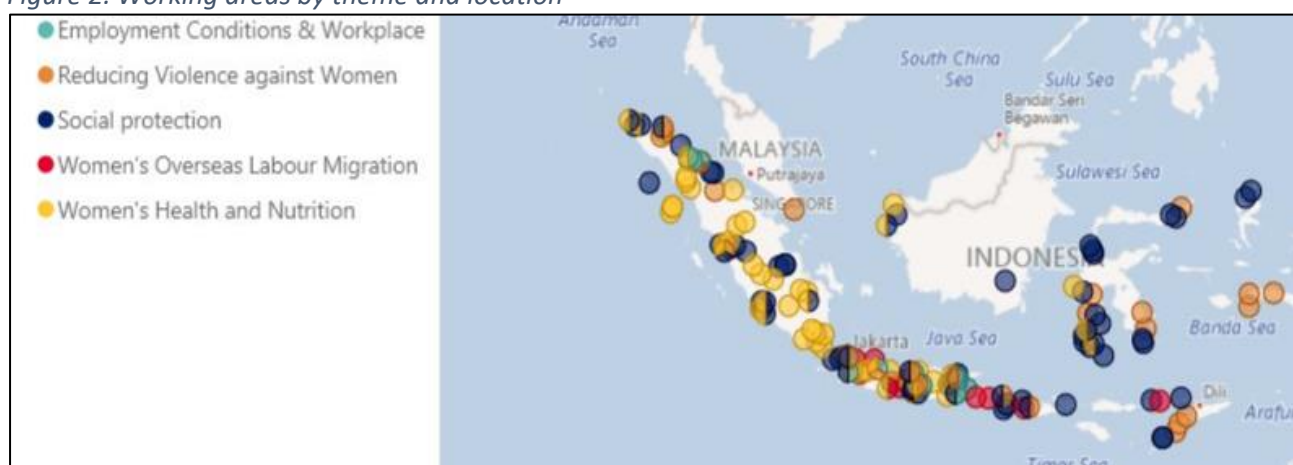
Figure 2. Working areas by theme and location

Respondents to the review reflected on the significant changes from the first phase to the second of the MAMPU program. While the increased engagement with Government of Indonesia was generally seen as a positive shift for the program, people commented that at that time there was probably insufficient attention to the changing context. There appeared to be an assumption that as a