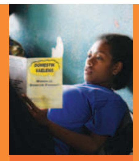
In the Port Vila vegetable markets, a young girl reads a booklet on domestic violence and her rights.