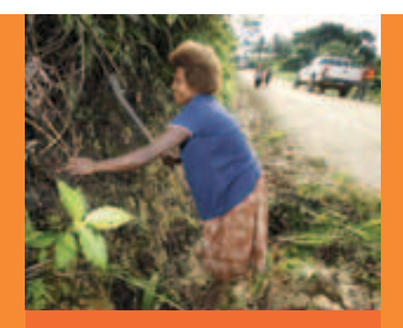
Local villagers clearing vegetation from beside the roads as part of a Community Sector Program in Solomon Islands