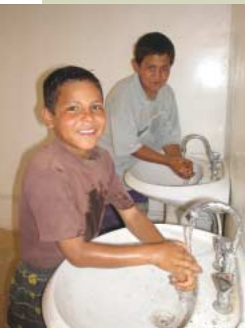
Washing hands – it feels so good.

As Ahmed, a ninth grader at his school, explains, ‘We need to drink, to wash our hands and to clean things. We were unable to use the toilets because they were blocked and dirty. We suffered a lot because of this lack of water.’