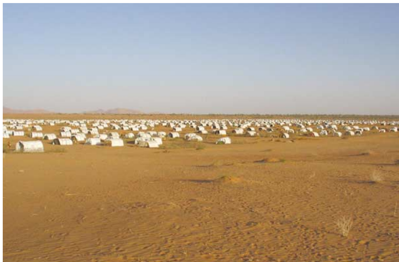
Abu Shok camp, Darfur, for internally displaced people.