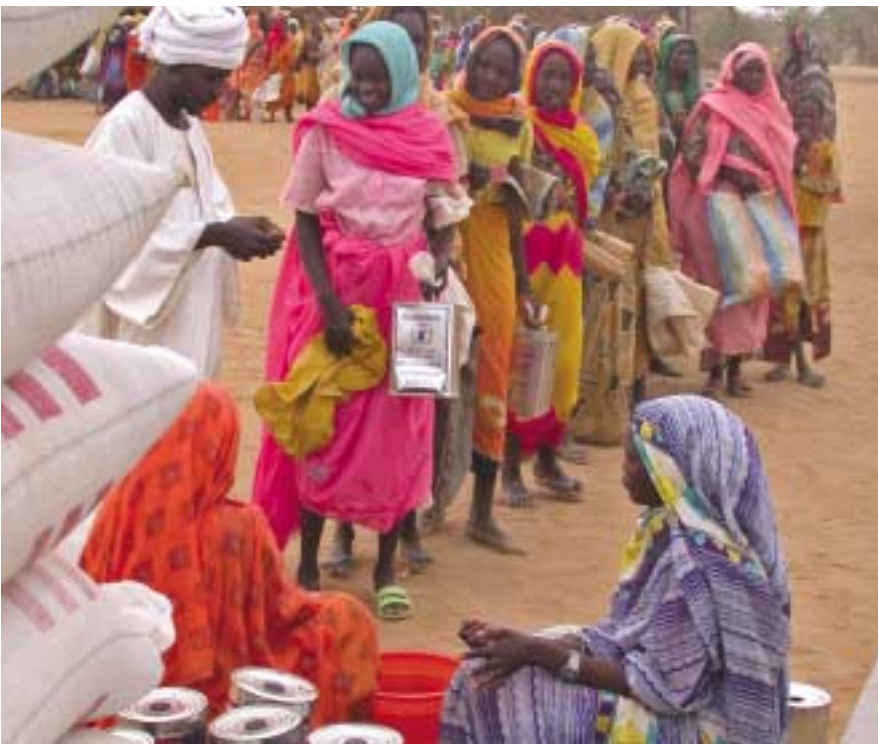
Queuing for food, Kasab camp, north Darfur.

the area prone to disease and seasonal flooding.