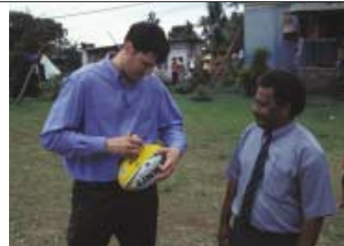
John Eales (left) is supporting the Oceania Sport Education Program.

A new sports education program worth $615,000 has also been announced which will further improve Australia's relationship with Pacific nations.