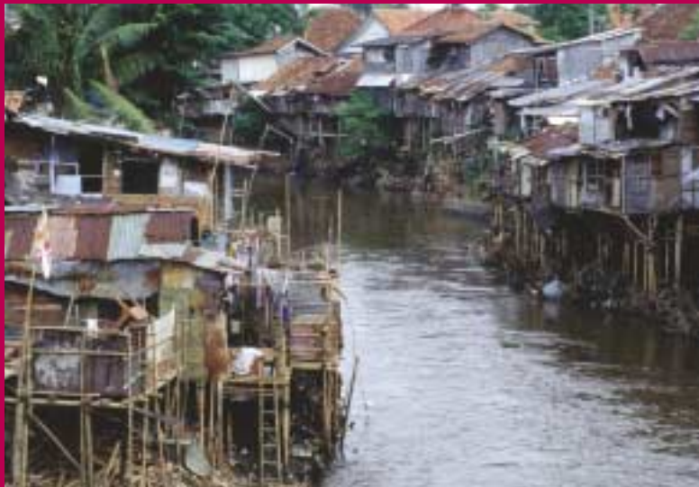
Where the poor live. Slum dwellings on stilts next to a polluted waterway, Jakarta.