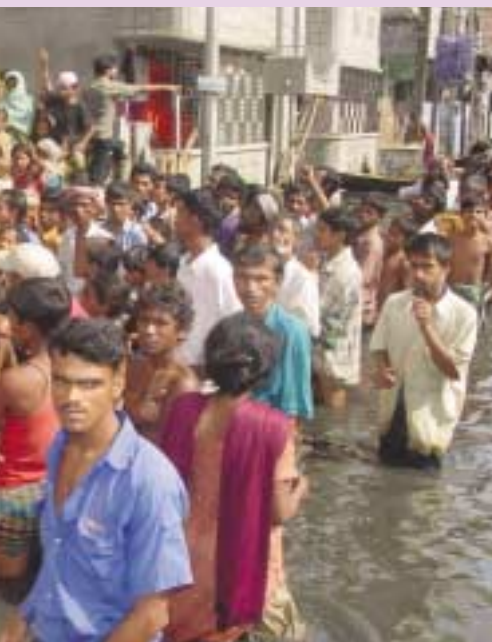
Waiting in flood water for emergency relief.

Out in the countryside, the water, which at one stage covered some 70 per cent of the country, is slowly leaching the arable land of soil nutrients. The 'aman' rice crop, representing half of national production, should be planted now but the land is still waterlogged from the July floods.