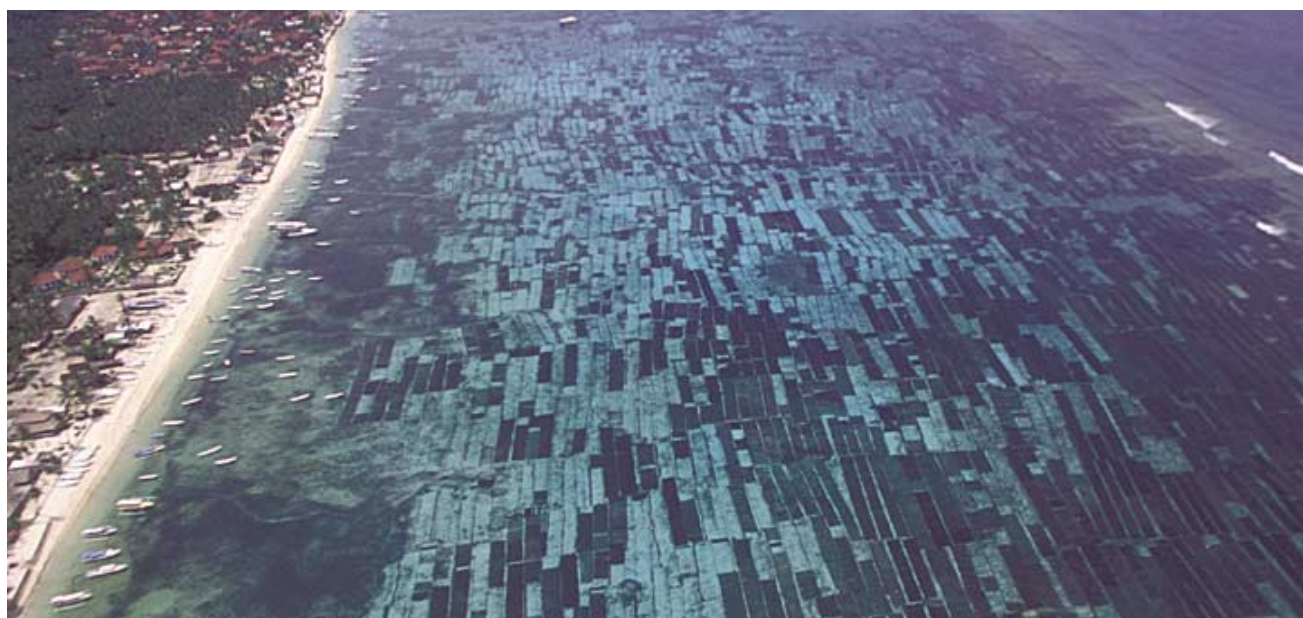
Aerial view of seaweed farms near Denpasar, Bali.

The Australian Government, through AusAID, is backing a bold plan to reduce poverty in thousands of Indonesian coastal communities by ‘turning aid into trade’. The strategy to help poor farmers add value to their product – and also gain direct access to lucrative international markets – is based on seaweed.