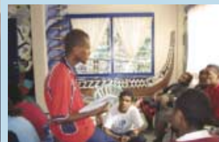
Young people find their voice, Honiara.

Supported by the Australian Government, through AusAID, a youth outreach project has been recently set up by Save the Children Australia across Honiara and five provinces.