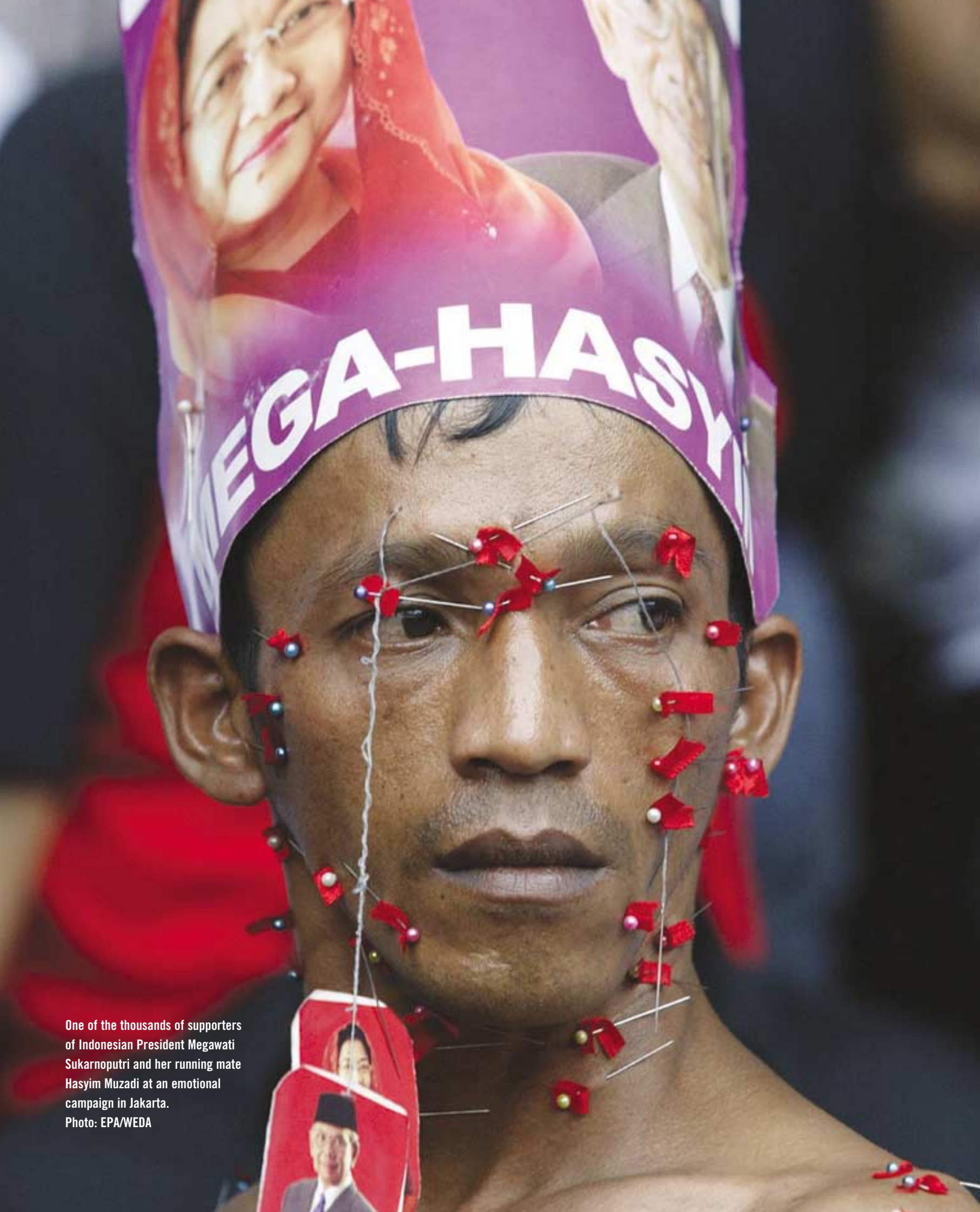
One of the thousands of supporters of Indonesian President Megawati Sukarnoputri and her running mate Hasyim Muzadi at an emotional campaign in Jakarta.