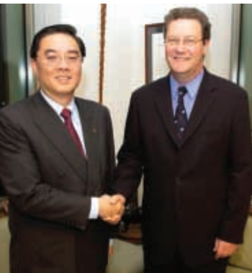
Mr Ong with Mr Downer. It was Mr Ong's first visit to Australia as ASEAN Secretary-General.

The Minister for Foreign Affairs, Alexander Downer, welcomed ASEAN Secretary-General Ong Keng Yong to Australia to mark the 30th anniversary of Australia's dialogue partnership with ASEAN.