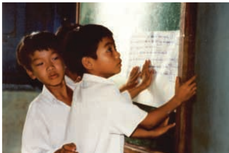
Active learning classrooms are catching on in Vietnam. In contrast to rote style methods of learning, children work cooperatively and are encouraged to ask questions.

In Vietnam, primary education had been based on traditional styles of learning, with children expected to memorise the lessons delivered by schoolteachers. The active learning approach shifts the focus of learning onto the child, and pupils become 'engaged' in the learning process with the teacher facilitating their learning. This means the children work collaboratively in groups to participate in creative exercises and educational games and are encouraged to express their point of view in class.