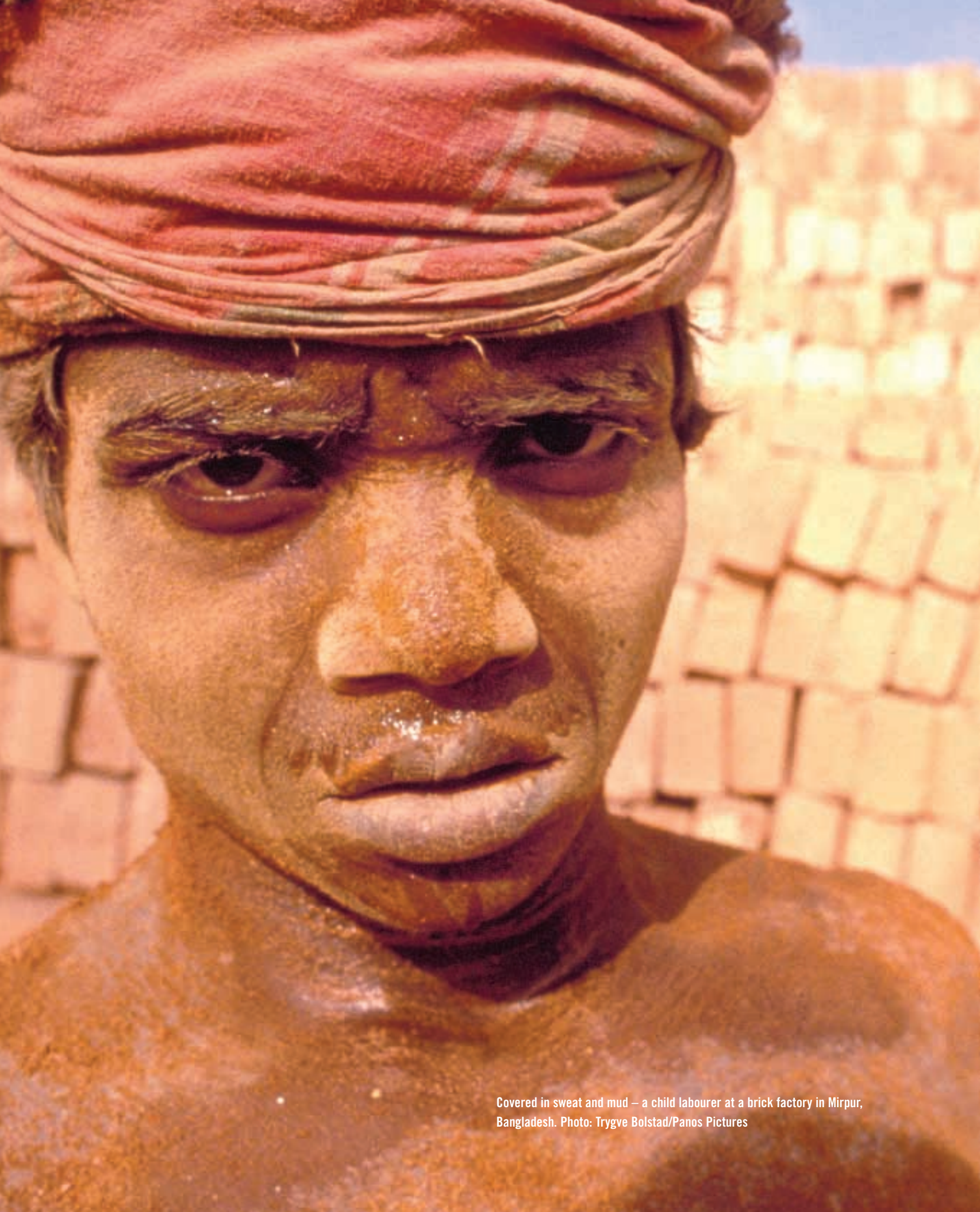
Covered in sweat and mud — a child labourer at a brick factory in Mirpur, Bangladesh.