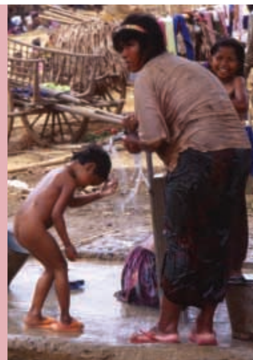
Making the best of the washing facilities at Ban Ma Muang Refugee Camp, Trat Province, Thailand.

'By providing assistance to these vulnerable groups, we reduce the incentive for them to undertake hazardous journeys to other countries within the region. UNHCR is one of Australia's key international partners in implementing programs to assist refugees and asylum seekers,' Mr Downer said.