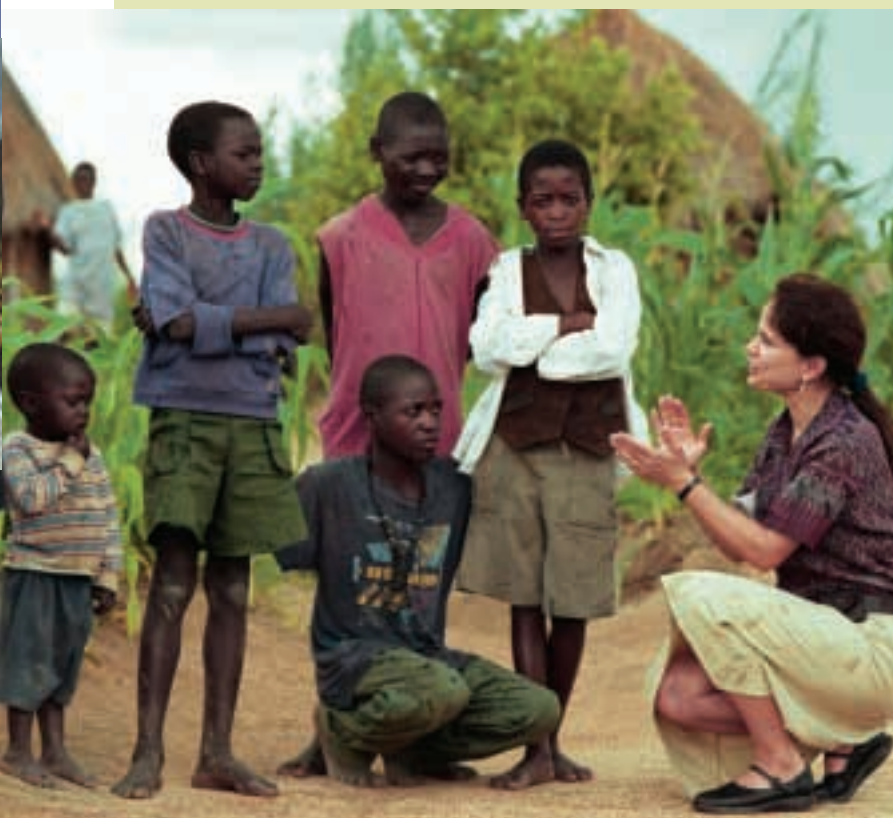
Sigrid Thornton talks to some children helped by the food aid program run by World Vision and supported by AusAID in Chainda, Zambia.

It's a long way from Pearl Bay, but World Vision Ambassador, and Australian actress, Sigrid Thornton recently visited a joint AusAID/World Vision food distribution program as part of a two-week tour of projects addressing the impact of HIV/AIDS in Zambia, Zimbabwe and South Africa.