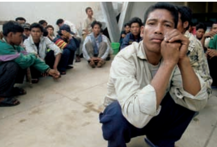
ABOVE: A group of Cambodian men wait to return to their families after being rescued by human rights workers from the southern province of Koh Kong, Cambodia. Hundreds of men and boys are sent to Thailand every month to work under slave-like conditions on fishing boats and construction sites.