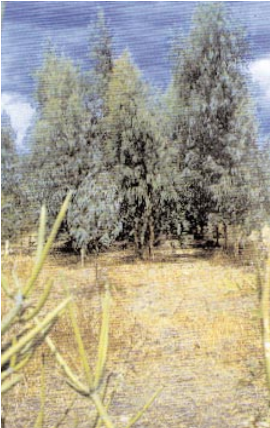
A private planting of eucalypts, maturing rapidly near the Ngudu to Ibindo Road.

members, of whom about 300,000 live in the area covered by the KRP. The tribe maintains strong traditional beliefs and cultural practices, and the socio-economic status of women is still very inferior to that of men.