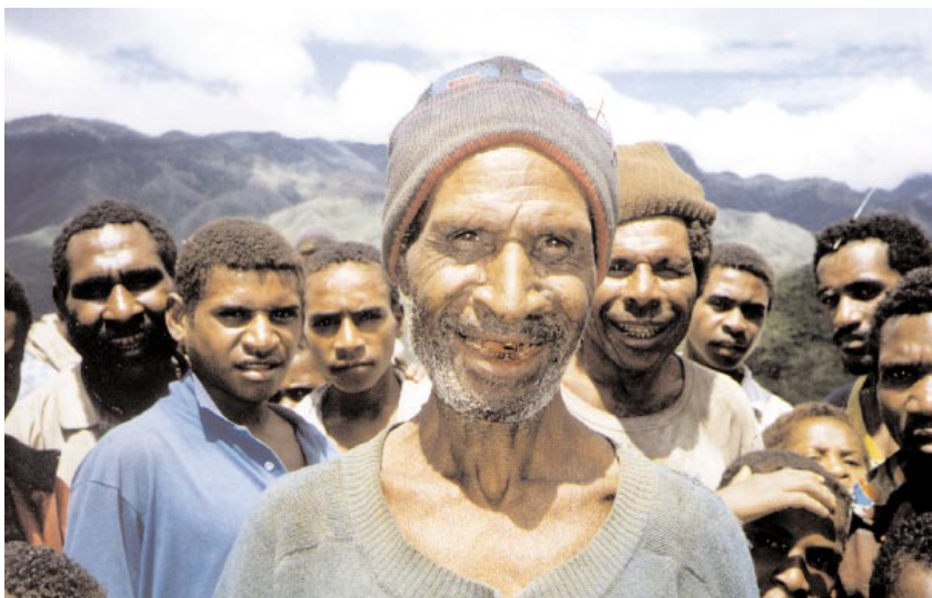
Villager Sevens Hav: pleased to have Australian seed potatoes to plant at Ononge.

the nearest passable road and the main communication link is by small plane. Planes land uphill on the tiny, dog-legged landing strip. The runway has a seven per cent gradient, with sheer hills dropping away hundreds of feet on either side.