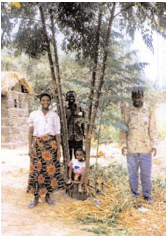
Private plantings near homes are becoming more popular, as this family in Nyamikoma village demonstrates.

recommended that the number of seedlings produced in larger central nurseries be reduced to encourage the trend towards private plantings.