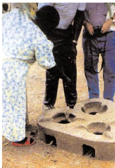
The heart-shaped stove is one local design yielding vastly improved fuel efficiency since the women of the KRP region swung behind the KRP idea early in its life.

By 1997 the new stove types were being used in almost 90 per cent of all homes in the KRP area, and usage was spreading