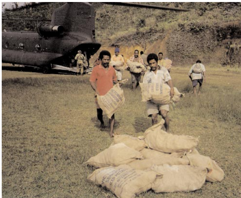
Seed potatoes arriving in the highlands after the rain.

The crisis has heightened farmers' awareness of their vulnerability to drought, making this a good moment to introduce more sustainable farming methods. Some effective traditional irrigation methods already exist in some parts of PNG, and AusAID is investigating ways to develop more village-level initiatives for crop irrigation.