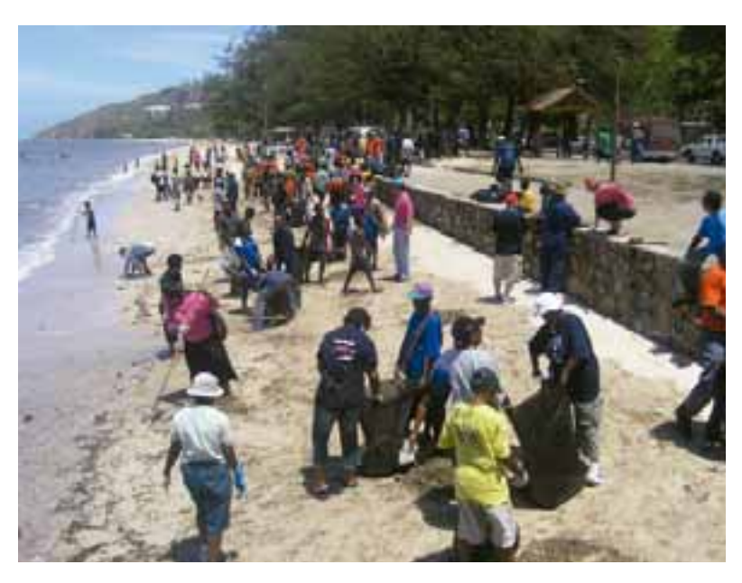
Picking up rubbish along Ela Beach in Port Moresby as part of 'clean up the world day'.

AusAID supports the Yumi Lukautim Mosbi project as part of its Law and Justice Sector Program.