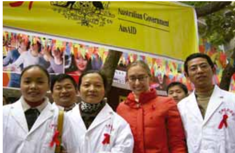
For more information on the Bazhong project < www.bzhip.info >

considerable progress in raising the standard of rural health, particularly in health promotion, basic health service delivery and health management systems.