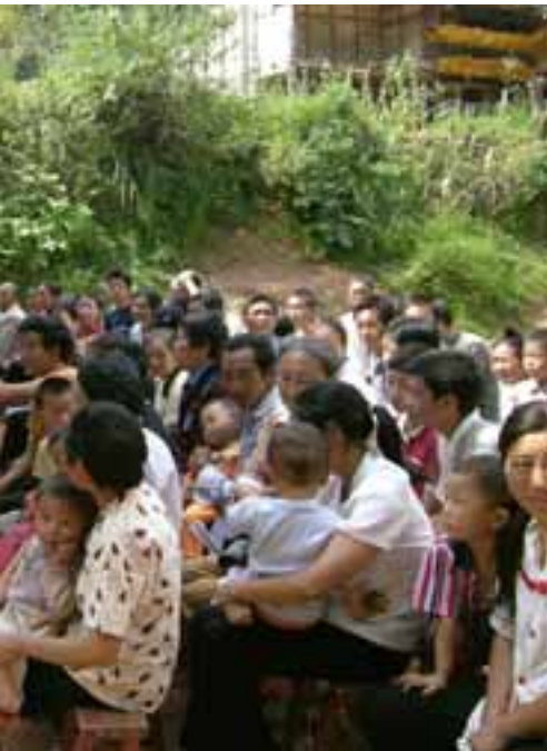
ABOVE: Villagers participate in a health promotion presentation on hepatitis and streptococcus suis. The latter is a relatively new disease in rural Sichuan Province. Caught from domesticated pigs, it can cause death within days. Health workers attached to the Bazhong project travel around the region to promote hygiene awareness and communicable disease prevention.