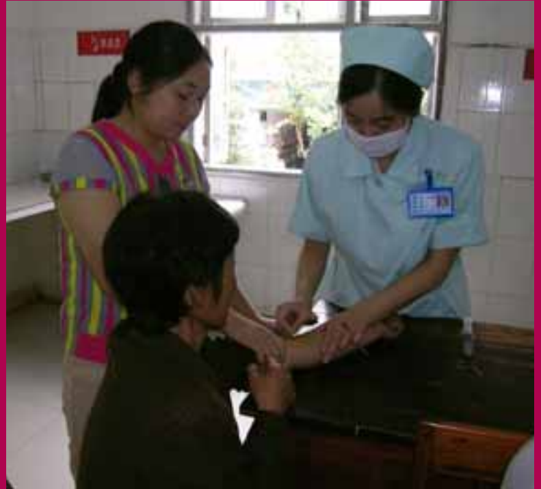
China. Medical procedure in progress. The AusAID Bazhong Rural Health Improvement Project is raising the standard of healthcare provided by clinics in Tongjiang.

THE WORLD'S POOREST 20 PER CENT OF PEOPLE ARE ROUGHLY 10 TIMES MORE LIKELY TO DIE BEFORE THEY REACH AGE 14 THAN THE RICHEST 20 PER CENT. WOMEN IN THE POOREST COUNTRIES ARE 500 TIMES MORE LIKELY TO DIE IN CHILDBIRTH THAN WOMEN IN THE DEVELOPED WORLD. MORE THAN 90 PER CENT OF MATERNAL AND CHILD DEATHS, AND 99 PER CENT OF MATERNAL DEATHS, OCCUR IN DEVELOPING COUNTRIES. INADEQUATE NUTRITION REMAINS THE SINGLE LEADING GLOBAL CAUSE OF POOR HEALTH.