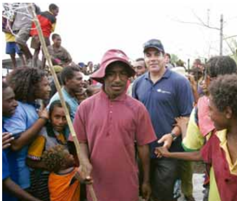
ABOVE RIGHT: Mal Meninga, considered a superstar by locals, is led through the crowd.