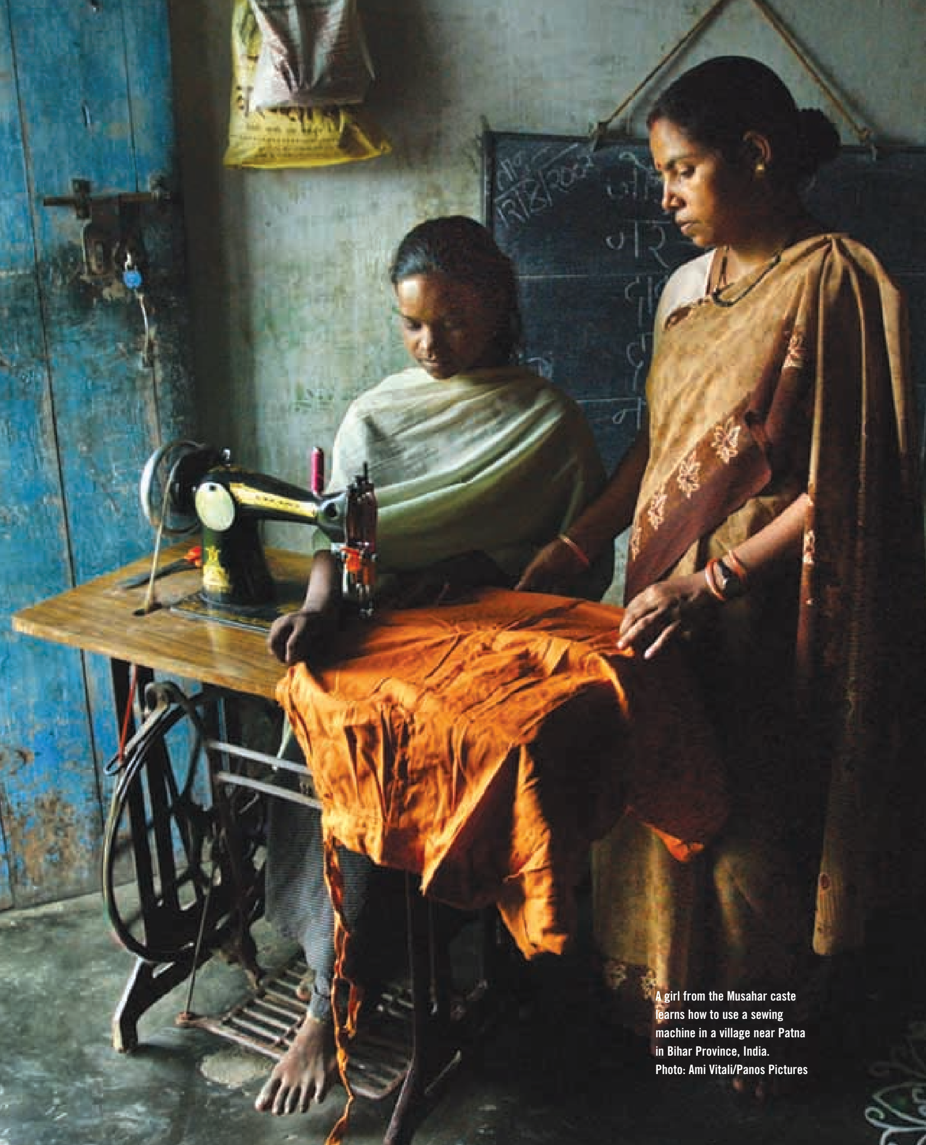
A girl from the Musahar caste learns how to use a sewing machine in a village near Patna in Bihar Province, India.