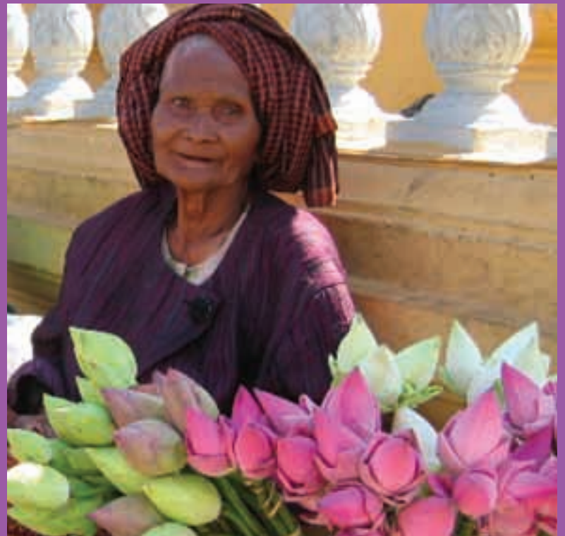
Lotus Lady, Cambodia.

WOMEN FROM AROUND THE WORLD GAVE IMAGES FOR THE RECENT WOMEN'S EYE ON PEACE EXHIBITION PROUDLY SPONSORED BY AUSAID AND ORGANISED BY THE INTERNATIONAL WOMEN'S DEVELOPMENT AGENCY. HERE IS A SELECTION.