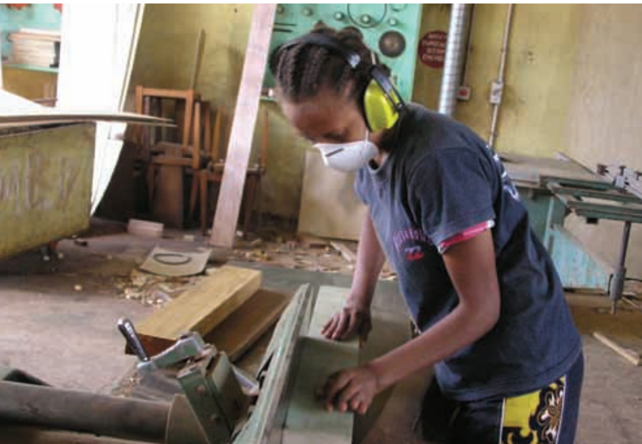
LEFT: Practising new skills in the woodwork class.