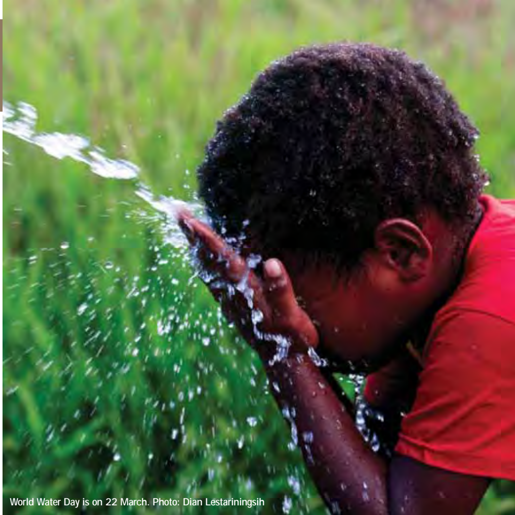
World Water Day is on 22 March.

Look out for this icon which tells you when you can find more information at Focus online. Visit http://www.ausaid.gov.au/focusonline/