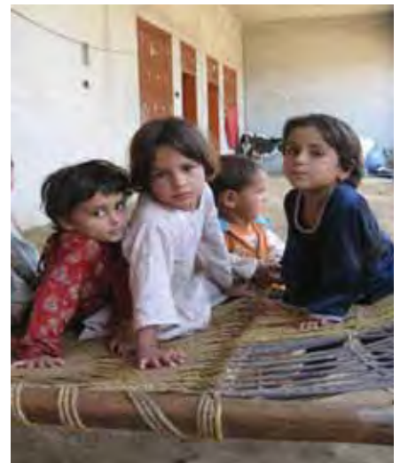
LEFT: Displaced children gather outside the food distribution hub in Swabi, North West Frontier Province, Pakistan.