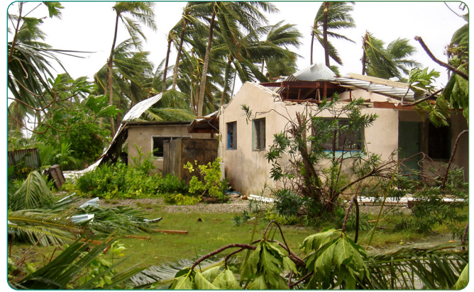
© Department of Foreign Affairs and Trade

Australia knows that an emergency response could be necessary in the Pacific at any time. Imagine you are in Australia's emergency response team and need to decide how to support each of the countries you studied as a hazard [choose a tsunami or cyclone] is expected within the next few hours. You have 1–2 minutes to make a decision for each of the factors listed below. There is no single correct answer.