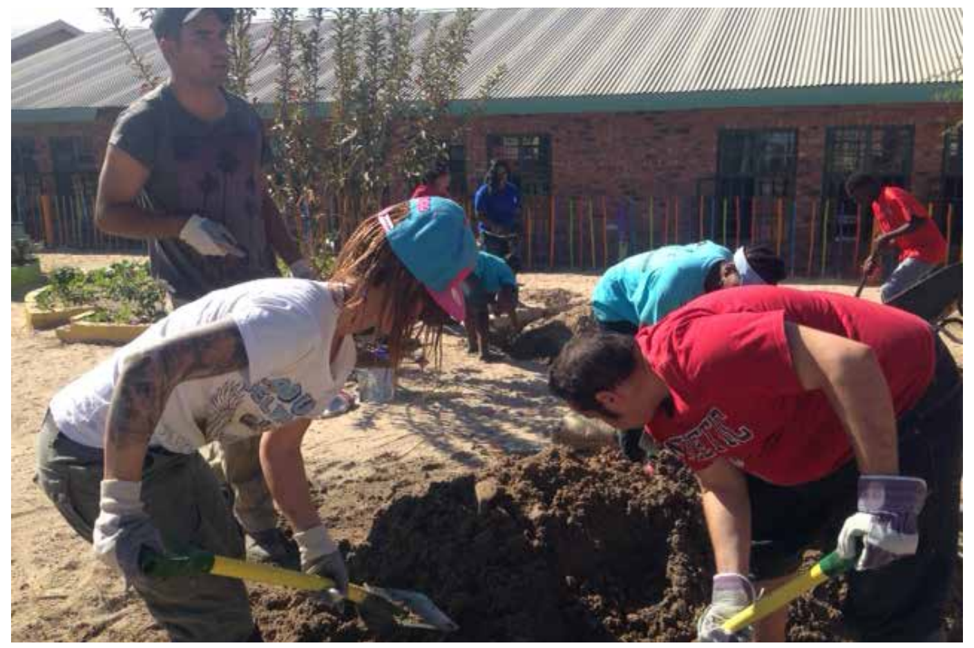
AVID (Classic Wallabies Exchange) volunteers building keyhole gardens at a Children's Eco Training School in the Greater Acornhoek region, South Africa.