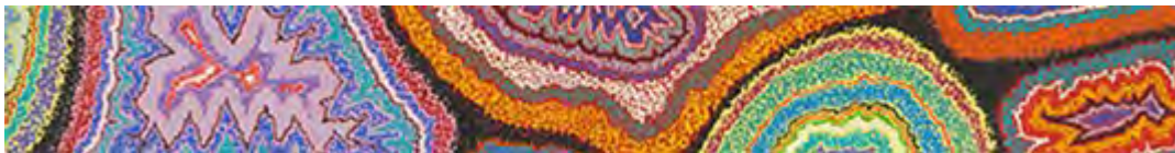
© Kim Hill, Among Women (2011)

dfat.gov.au | Twitter | Facebook | Instagram | LinkedIn