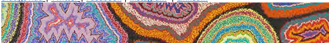
© Kim Hill, Among Women (2011)

Pacific Sports Section Polynesia and Partnerships Branch | Polynesia, Micronesia and Development Division Department of Foreign Affairs and Trade s 22(1)(a)(ii) dfat.gov.au | Twitter | Facebook | Instagram | LinkedIn