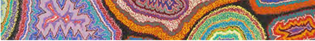
© Kim Hill, Among Women (2011)

dfat.gov.au | Twitter | Facebook | Instagram | LinkedIn