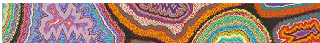
© Kim Hill, Among Women (2011)

dfat.gov.au | Twitter | Facebook | Instagram | LinkedIn