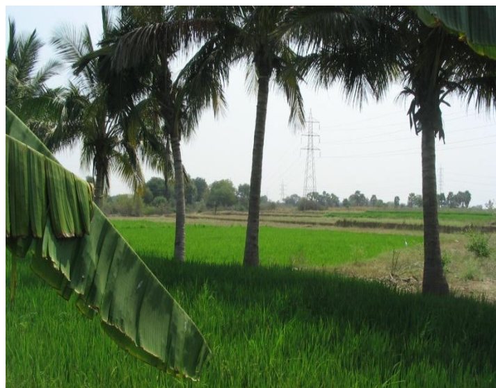
Mixed tree cropping system, India

The project will also address the delivery and use of seasonal climate information across different elements of society - from policy to agri-business to the farming community.