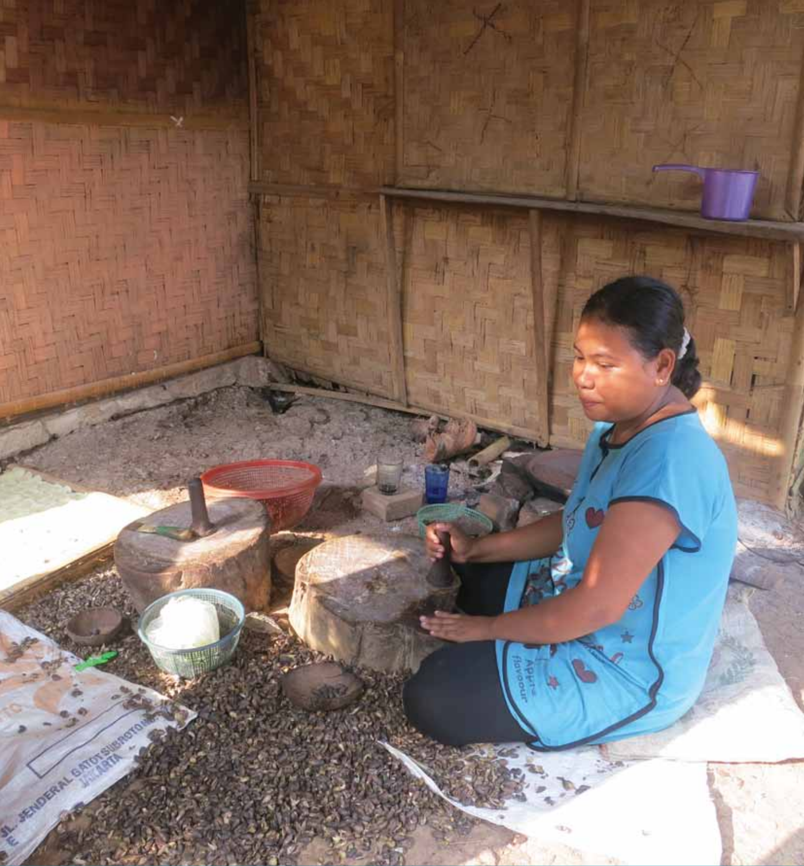
A recipient of Indonesia's RASKIN program (rice for the poor). RASKIN is a focus of the National Team for Accelerating Poverty Reduction (TNP2K), which develops policy options to reduce poverty in Indonesia. With the support of AusAID's Poverty Reduction Support Facility, TNP2K is improving evidence about the impact of RASKIN through a randomised control trial evaluation, a social impact study, and a study to assess the effectiveness of the Unified Database on RASKIN. This evidence will be used to improve the effectiveness and targeting of RASKIN.