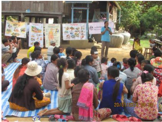
Figure 1: TPO staff conducted Psycho-education in community

At the end of psycho-education session as well as other community activity, TPO staff always mentions that this project is made possible through the generous donation from the people of Australia.