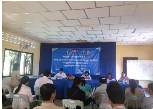
Figure 1: Commune Committee for women and children meeting