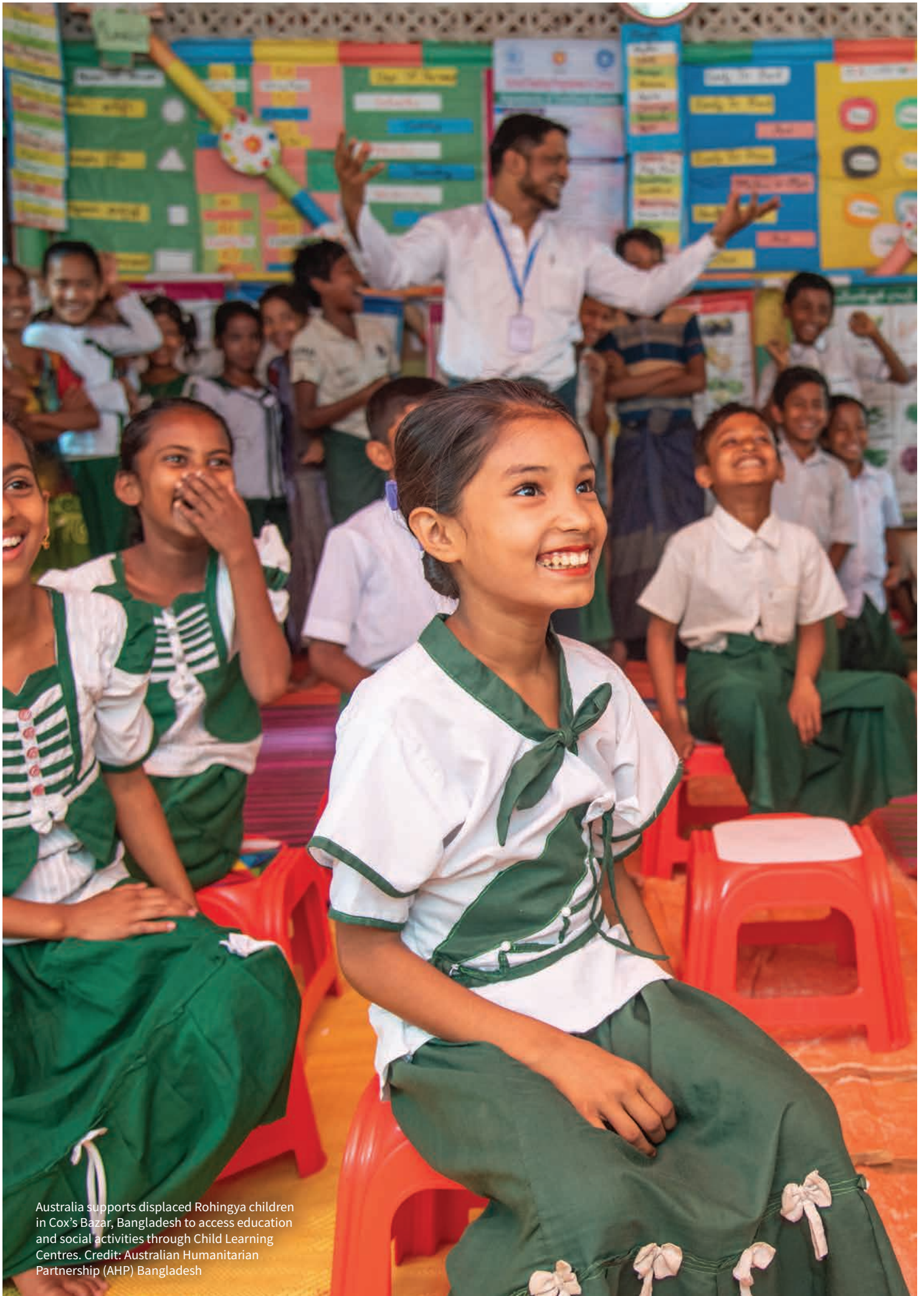
Australia supports displaced Rohingya children in Cox's Bazar, Bangladesh to access education and social activities through Child Learning Centres.