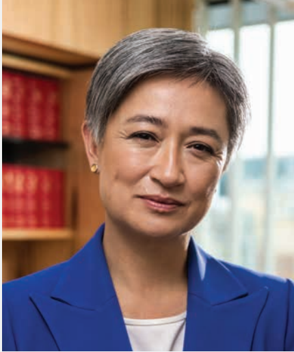
Senator the Hon Penny Wong