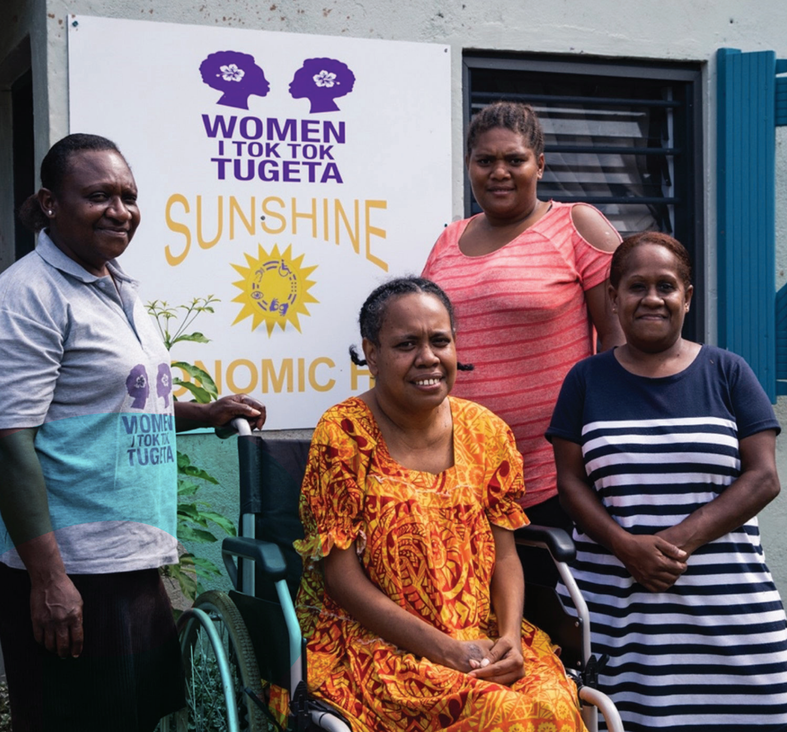
Action Aid's Women I Tok Tok Tugeta Sunshine Group supports women with disability during disasters in Vanuatu.