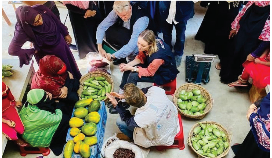
Australian officials visiting Cox's Bazar in Bangladesh.

Australia works closely with the Philippines to support its local leadership capacity and resilience to disasters, underpinned by our Strategic Partnership. Our enduring partnership has focused on long-term governance strengthening to ensure effective and efficient humanitarian systems and processes. In November 2013, Typhoon Haiyan struck the Philippines, claiming the lives of more than 8,000 people and affecting more than 14 million. Eight years later in December 2021, a typhoon of similar intensity passed through the country and claimed around 400 lives — 5 per cent of the lives lost in 2013. Strong local governance, disaster preparedness and response systems and community resilience have been critical over this time period.