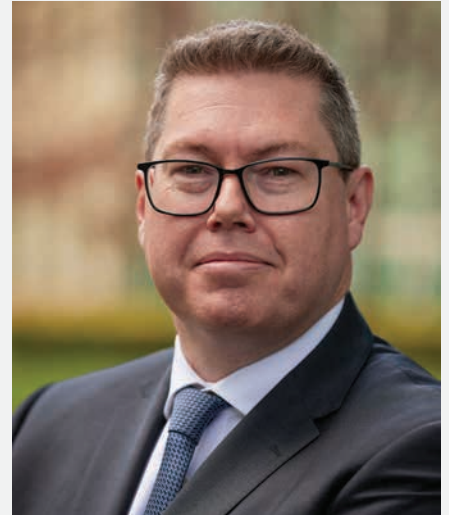
The Hon Pat Conroy MP

We recognise that Australia's humanitarian action is a whole-of-country endeavour — we will work together to build a region that is more prepared to tackle disasters.