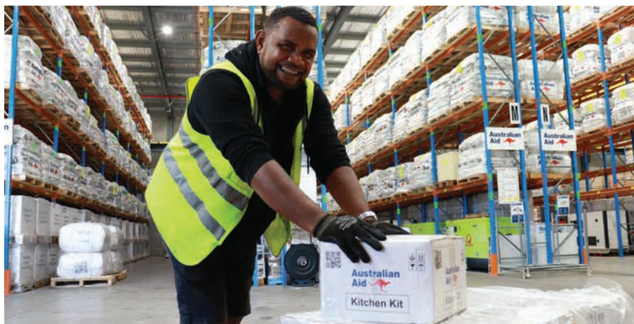
The Australian Humanitarian Logistics Capability warehouse in Brisbane stores supplies which are transported to communities affected by crisis.

First Nations peoples have a deep connection to, and understanding of, the natural environment and weather patterns – knowledge that has been passed down over generations. They have cared for Country and communities for millennia, including during natural hazards such as droughts, floods and bushfires. We recognise that First Nations peoples have much to contribute to disaster planning and preparation, both in Australia and overseas. We will work in partnership with First Nations communities to inform areas of our humanitarian action overseas. This will necessarily take time and involve new ways of working to foster genuine connections, to promote shared growth and understanding.