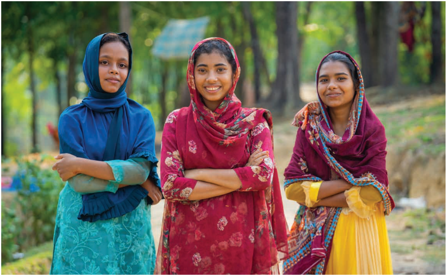
Members of the Taipalong youth club in Cox's Bazar in Bangladesh, which is supported by the Australian Humanitarian Partnership.