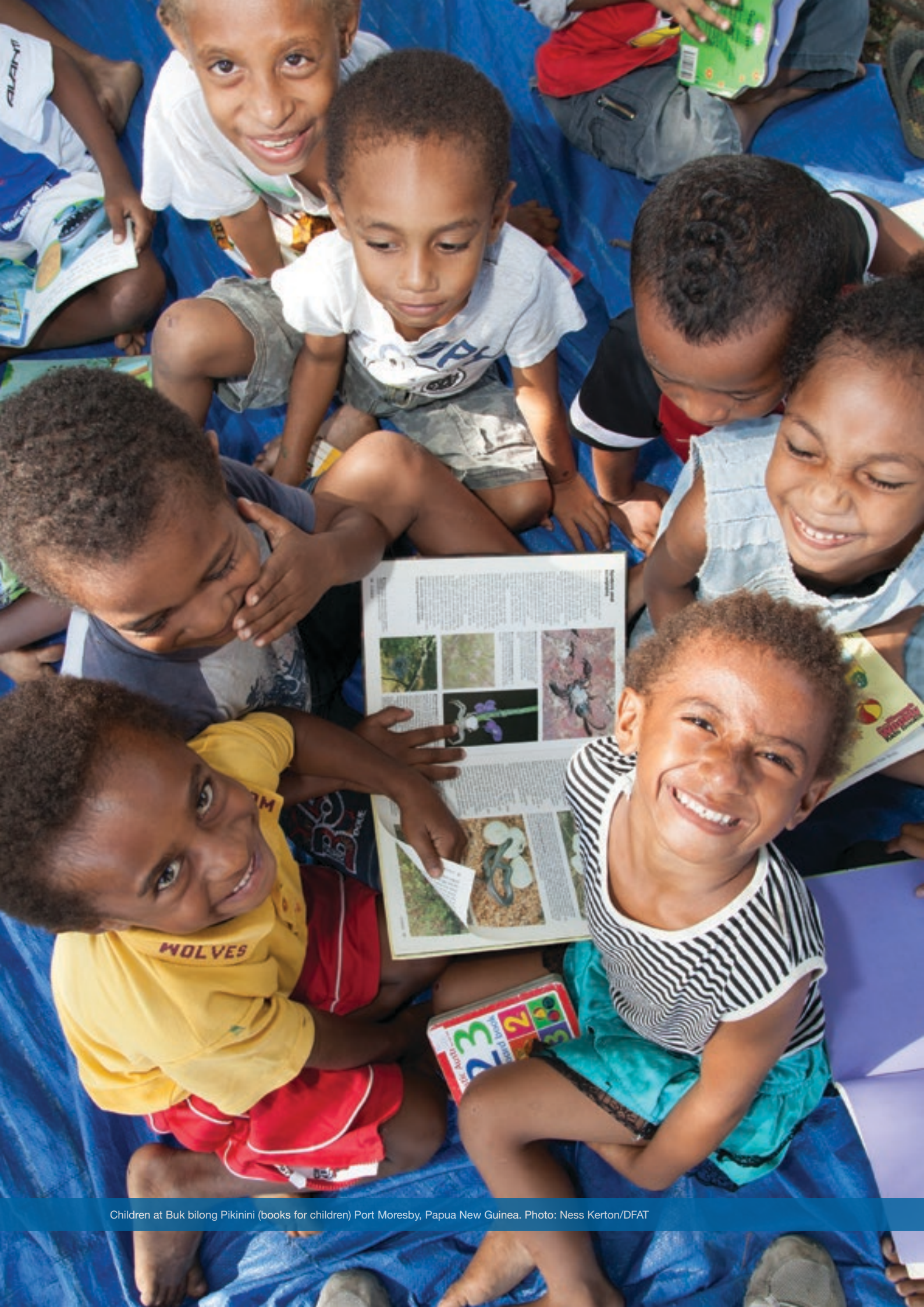
Children at Buk bilong Pikinini (books for children) Port Moresby, Papua New Guinea.