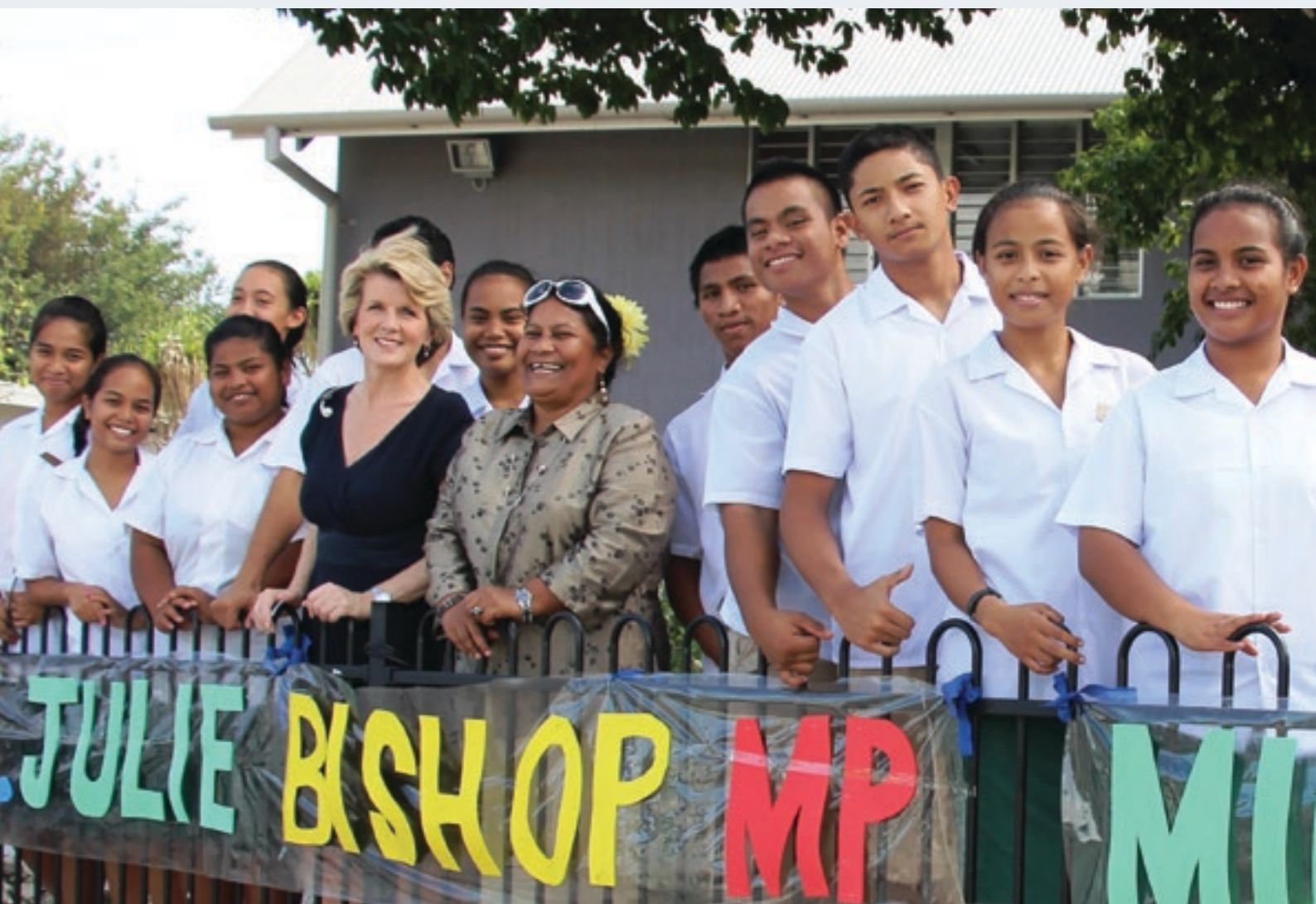
Minister for Foreign Affairs, the Hon Julie Bishop MP, pictured with Nauru's Minister for Education, the Hon Charmaine Scotty, and students at the refurbished Nauru Secondary School, December 2013.