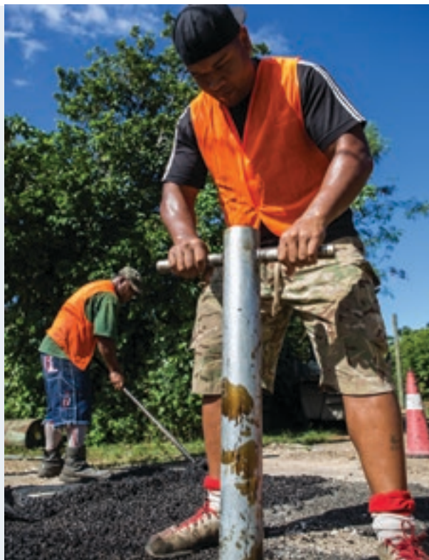
Road repairs in Tongaputu, Tonga.