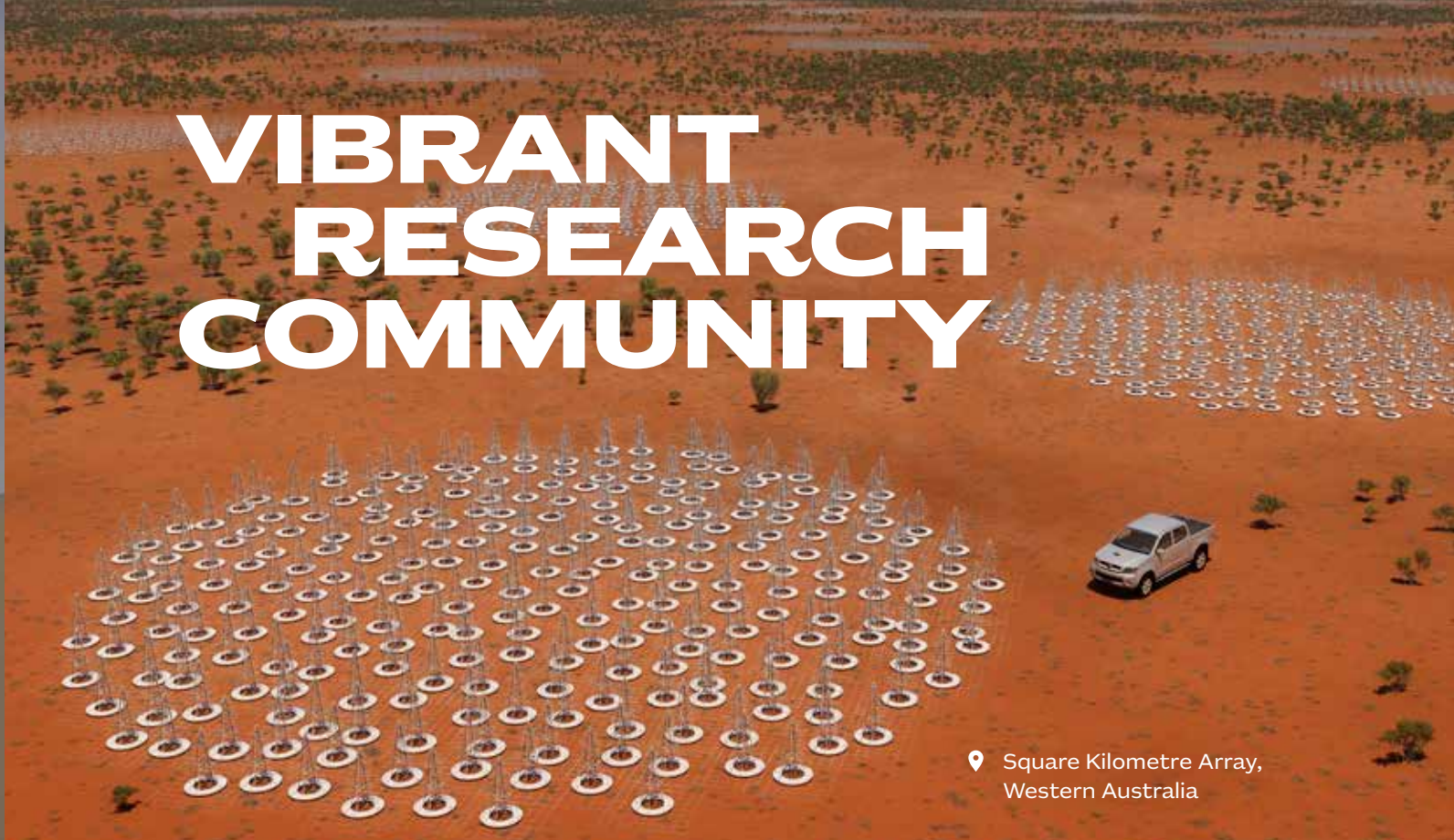
📍 Square Kilometre Array, Western Australia

16 Australians have won Nobel Prizes, half of them in Physiology or Medicine. Innovation drives Australian enterprise, science and research sectors, as well as our response to global crises, and is a priority of the Australian Government. We have a vibrant research community working to address global challenges and we have developed and implemented a National Innovation and Science Agenda that supports smart ideas to create business growth, local jobs and global success. Australia is ranked 1st in technological readiness and ranked 5th for global entrepreneurship. 11