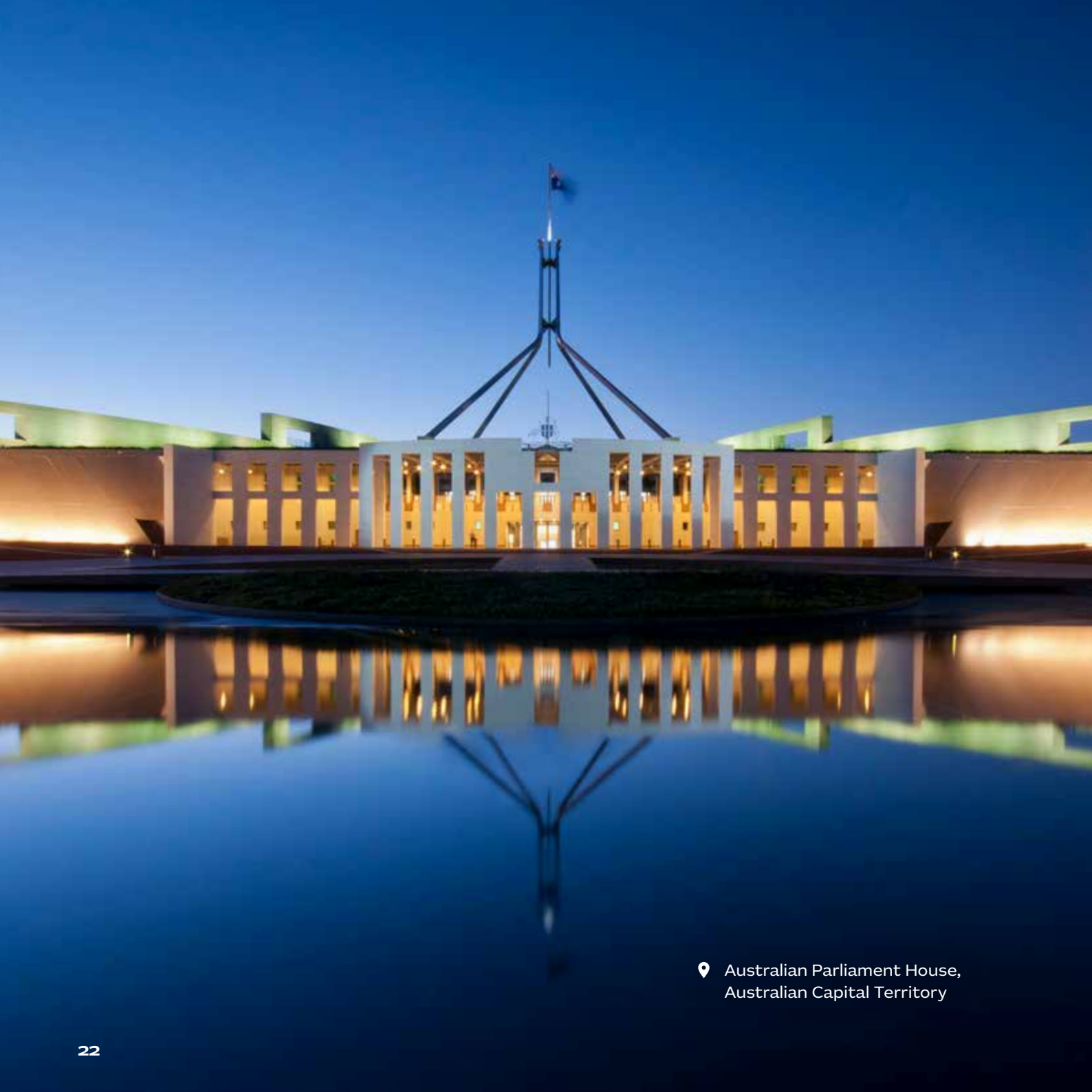
📍 Australian Parliament House, Australian Capital Territory