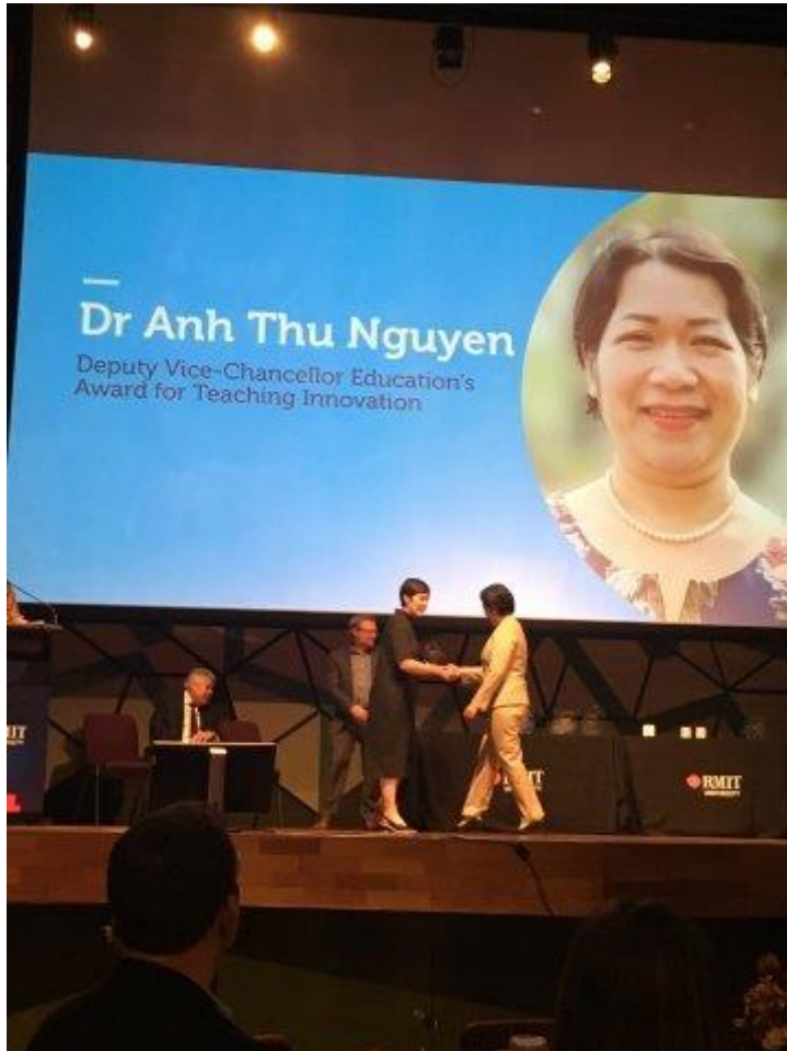
Image 4 Deputy Vice-Chancellors Education Award Ceremony