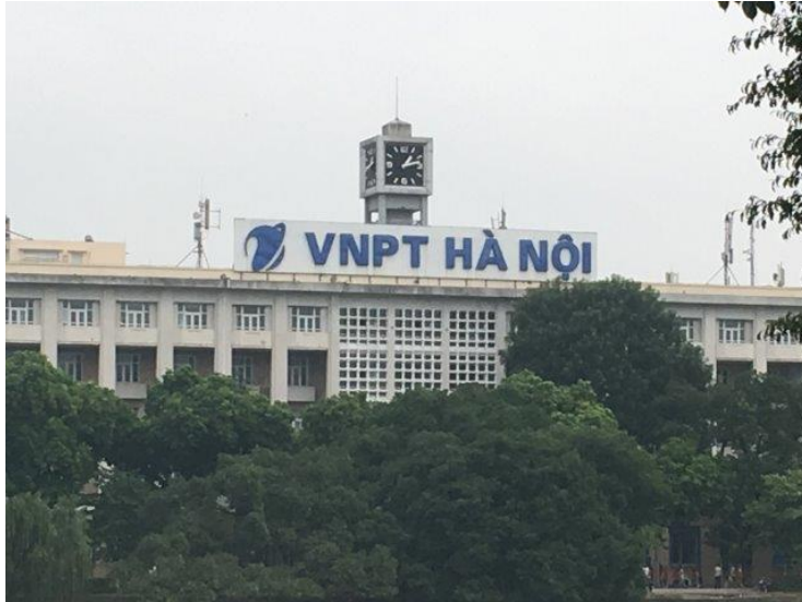
Image 5 VNPT-Net Telecommunications Giant