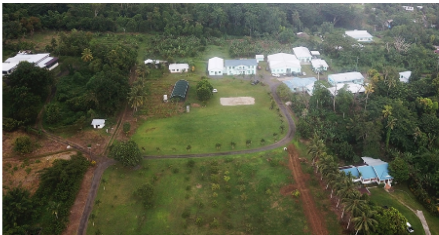
The Scientific Research Organisation of Samoa, which has ‘deep ties’ with the Australian Centre for International Agricultural Research (ACIAR).