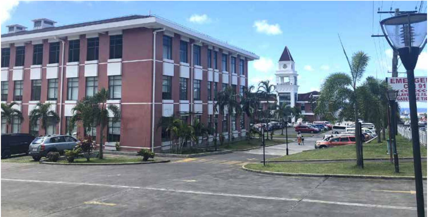
Tupua Tamasese Meaole Hospital, Apia

Her position in the hospital also means she oversees the procurement of equipment and donations. This has ensured that the equipment they use are safe and as up to date as possible, rather than having to rely on outdated and potentially dangerous machines.