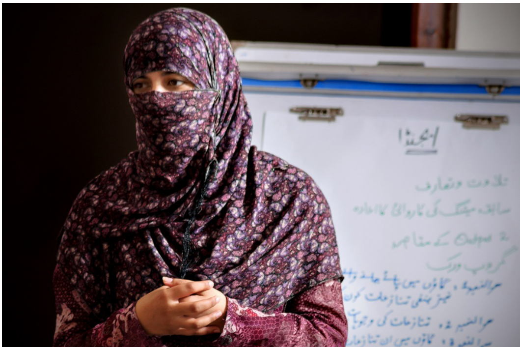
Participant in AAWAZ Voice and Accountability Programme planning session, 2014.

Violence against women and girls, is a violation of fundamental human rights, a barrier to women's active citizenship, and hence, a fundamental constraint to them actualising their full potential and to a life with dignity.