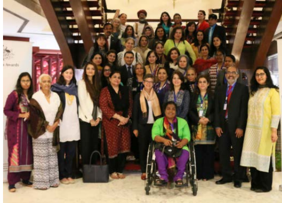
2016 Australia Awards Informal Learning Opportunity: Entrepreneurs, leadership and peace roundtable