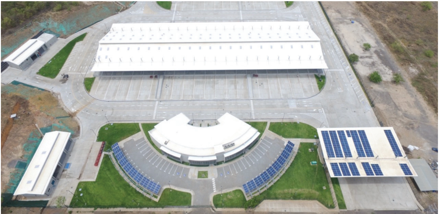
The newly built Regional Wholesale Market in Chorotega by PIMA