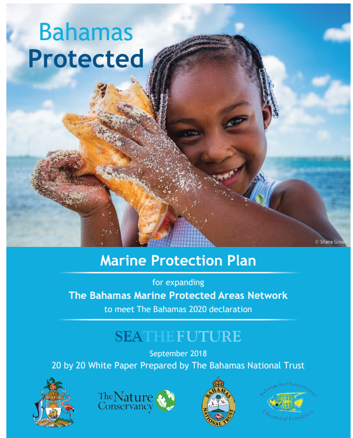
Bahamas Protect (2018), 'Marine Protection Plan'. Credit: http://bahamasprotected.com/wp-content/uploads/2018/02/Bahamas-Protected-Marine-Protection-Plan.pdf .

Dr Arias states that if approved by the Government of the Bahamas, 'the Bahamas will be the only country in the Caribbean protecting 20 per cent of its ocean'. The Bahamas Government states that the White Paper will help solve major issues such as the decline in marine resources from negative impacts, including climate change and poaching (Adderley, 2018).