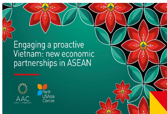
Web banner with project title and logos