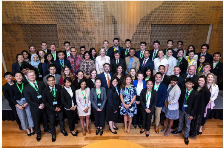
ASEAN-Australia Young Leaders Forum, Australian Embassy Jakarta December 2019

Grantee: ASEAN-Australia Strategic Youth Partnership Ltd