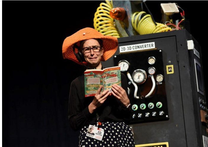
CDP Theatre Producers stage play of 'The 13-Storey Treehouse'