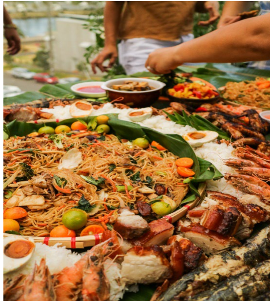
Calamansi for a Filipino Kamayan Feast