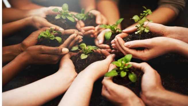
Australian-ASEAN business leaders commit to a green recovery

Grantee: Sustainable Business Australia (SBA) Limited trading as Business Council for Sustainable Development Australia