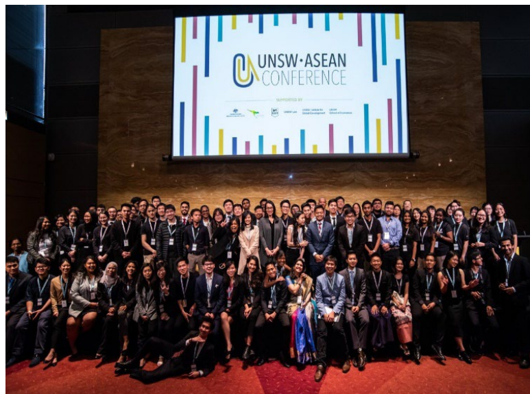
UNSW ASEAN Conference 2019, John Niland Scientia Building UNSW, 12 October 2019