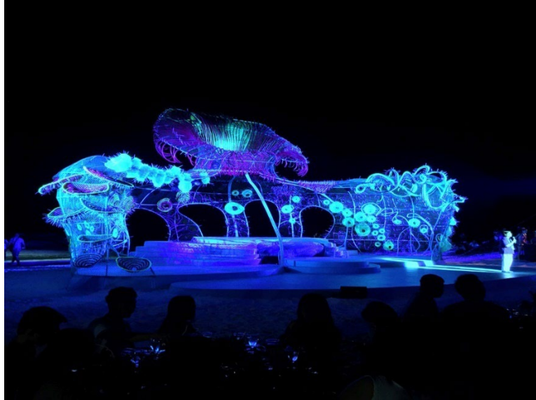
Leeroy New, Polyp Stage-Installation, 2015. Installation view at Boracay, Philippines