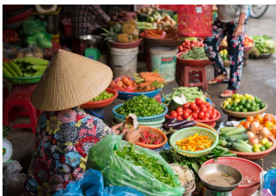
Vietnamese woman selling vegetables at market in Hoi An