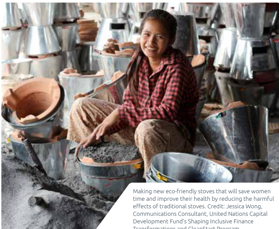
Making new eco-friendly stoves that will save women time and improve their health by reducing the harmful effects of traditional stoves.

The new clean-cook stove can be bought using credit, which means more women can buy it, an important factor given that 70 per cent of Cambodian women do not have access to formal financial services. With Australia's support, WOCAN measured and verified that the innovative stove and credit model met the W+ Standard. Verified W+ units can be purchased with proceeds going to communities in Cambodia.