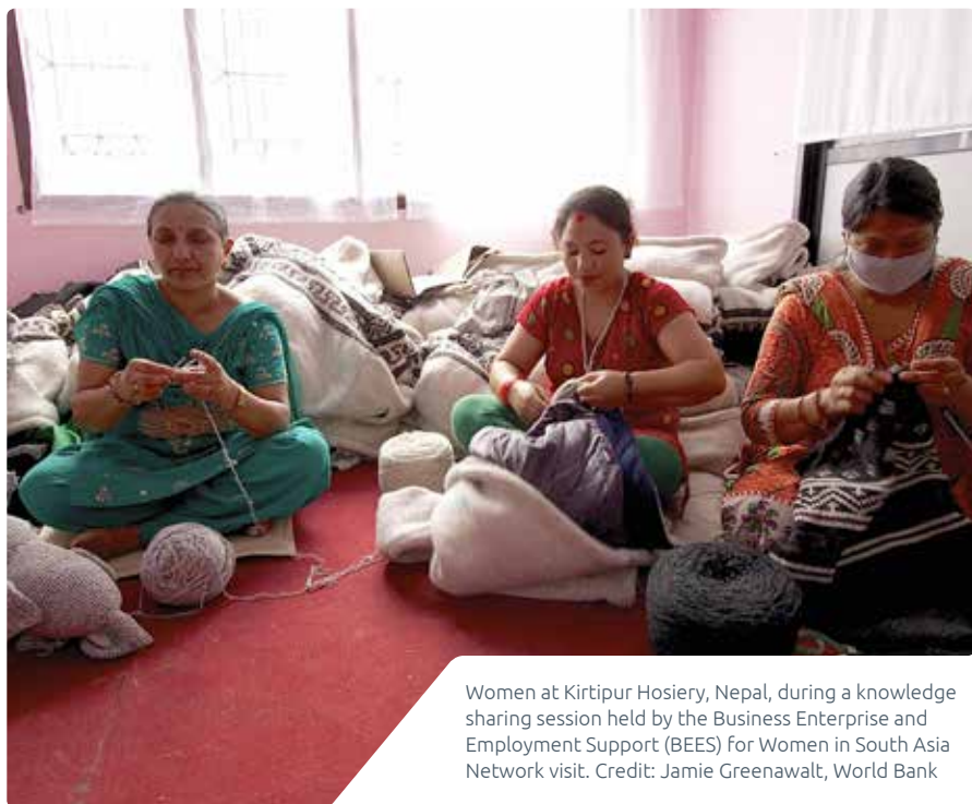
Women at Kirtipur Hosiery, Nepal, during a knowledge sharing session held by the Business Enterprise and Employment Support (BEES) for Women in South Asia Network visit.

Through SARTFP, the Australian Government supports the World Bank's Business Enterprise and Employment Support (BEES) for Women in South Asia Network, a regional group of civil society organisations from each country in South Asia. The goal of the BEES network is to provide a forum for knowledge sharing, learning, collective action and advocacy on women's economic empowerment as well as sharing good practices and intervening to help women climb out of poverty. The BEES network holds a series of meetings and workshops and facilitates learning exchanges in each country in South Asia, enabling access to finance, markets, training, knowledge and peer support.