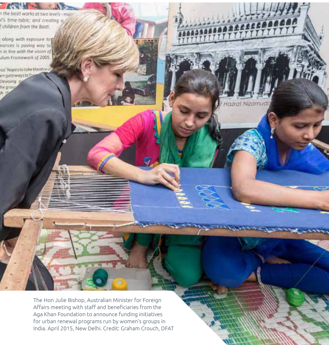
The Hon Julie Bishop, Australian Minister for Foreign Affairs meeting with staff and beneficiaries from the Aga Khan Foundation to announce funding initiatives for urban renewal programs run by women's groups in India. April 2015, New Delhi.