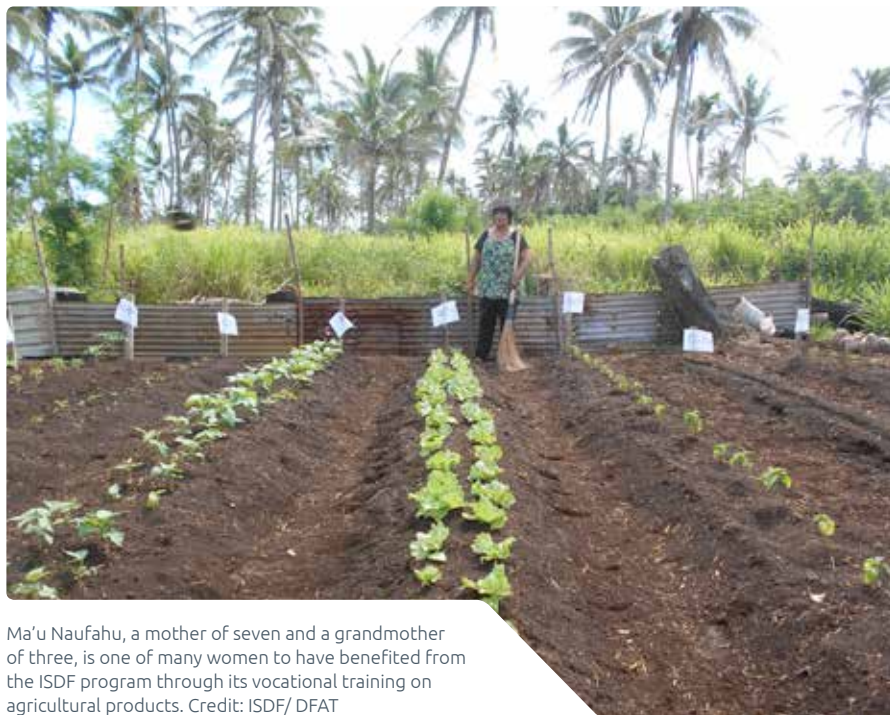
Ma'u Naufahu, a mother of seven and a grandmother of three, is one of many women to have benefited from the ISDF program through its vocational training on agricultural products.

Women on average make up 43 per cent of the agricultural labour force in developing countries. They make significant contributions to agriculture and food security. 14 Supporting women to improve agricultural productivity and giving them access to local, regional and international markets helps them increase their incomes and self-reliance, and reduce poverty.