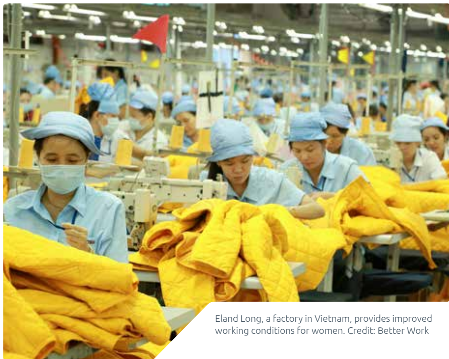
Eland Long, a factory in Vietnam, provides improved working conditions for women.

Australia is working with ILO to address violence against women, which has a negative impact on productivity, and providing female factory staff with healthcare and childcare services. In the coming years, Australian support will help women build the skills they need to contest trade union leadership positions and progress to senior management.