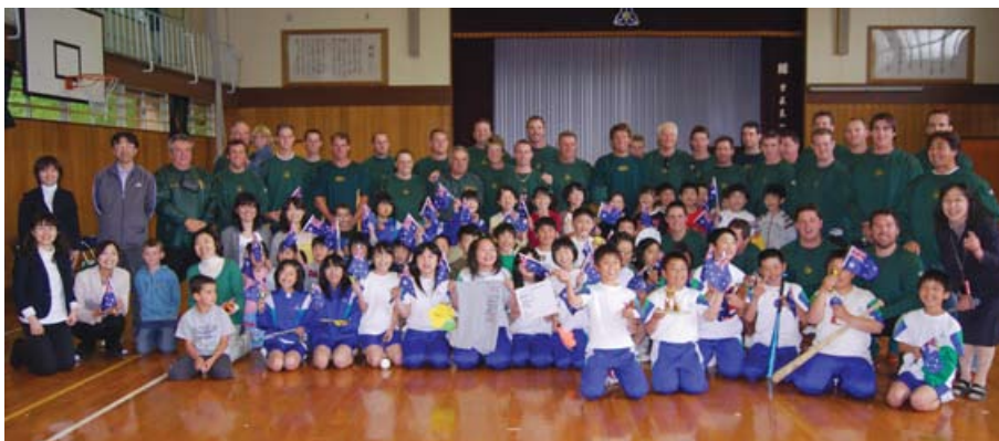
Australian Provincial Baseball Team visit to Kawame Primary School in Morioka.