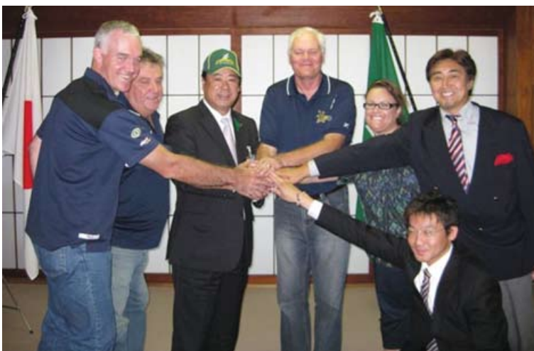
Australian Provincial Baseball Team officials and representatives of Japanese local government and Japanese baseball associations.