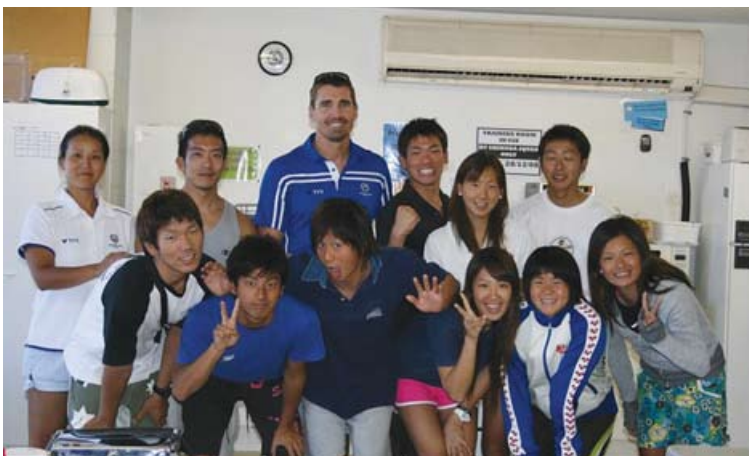
Members of the Shimoda Surf Life Saving Club with five times Australian Olympian, Mr Clint Robinson.