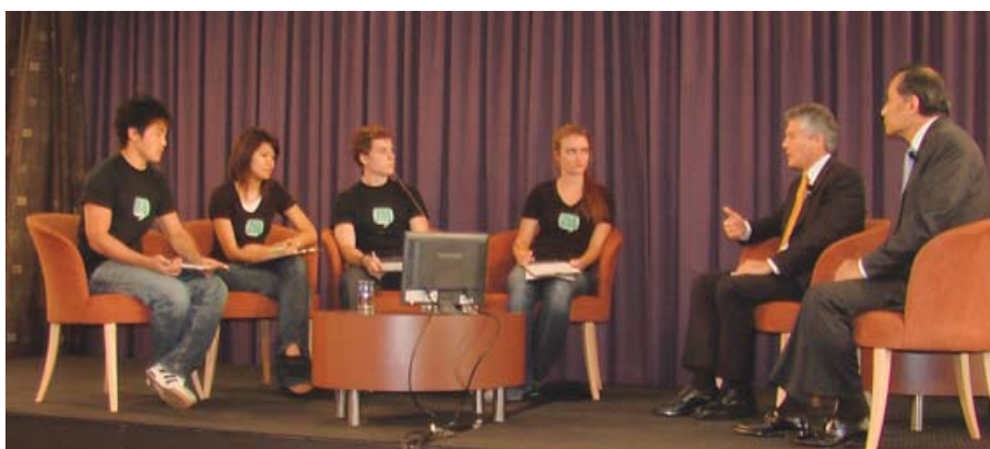
2008 Australia Japan Talkback Classroom Forum. Students interviewing the Minister for Foreign Affairs, the Hon Stephen Smith MP, and the Japanese Ambassador to Australia, His Excellency Mr Taka-aki Kojima.

Talkback Classroom provides a forum for senior secondary school students to investigate issues of international significance and record interviews for broadcast with national and international decision makers. The student panel completes a comprehensive program of online study and reciprocal visits. Their interviews and reflections are also captured in a series of mini-documentary style film clips to complement their daily diary entries in a project blog. See www.talkbackclassroom.com.au