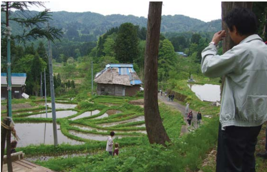
View of 'Australia House' at the fourth Echigo-Tsumari Art Triennial.

The Echigo-Tsumari Art Triennial is one of the world's largest international art festivals held in the rustic mountainous Echigo-Tsumari region of Niigata Prefecture. It aims to revitalise the rapidly depopulating rural region through art. Approximately 350 works are exhibited in a region of 760 square kilometres of stunning rural Japanese countryside. Sculptures pepper the countryside and closed-down schools and abandoned houses have been turned into exciting, contemporary art works. Australia has had a deep connection with Echigo-Tsumari ever since the first Art Triennial was held in 2000, and is the first country to establish a country 'pavilion' in the region.