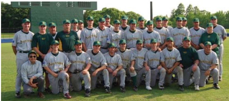
Members of the Australian Provincial Baseball Team 2009.