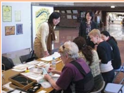
City Hall Demonstration.

Living in Australia with English ancestry, I often feel the lack of connection to my heritage. Travelling to Japan gave me a huge sense of awe at the depth of aesthetic and spiritual sophistication of ancient Japan. I am very grateful to the Australia-Japan Foundation for helping me to exhibit and teach in this noble and historic land.