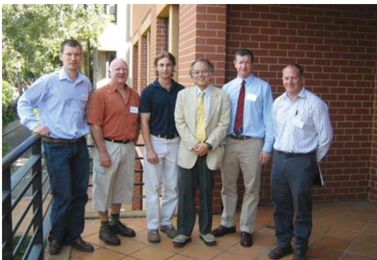
Veterinary Protozoology Forum held at the University of Sydney. Camperdown Campus on 23 March 2009.