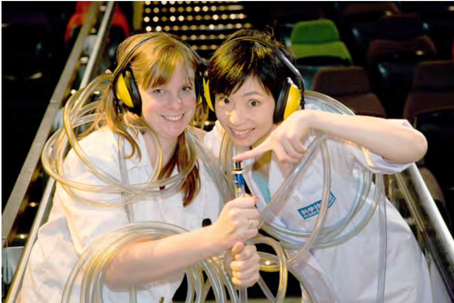
One of the Japanese Exchange Science Performers and a Questacon Excited Particle.