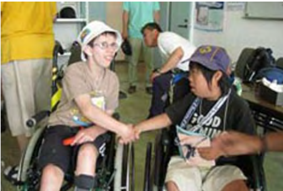
Australian and Japanese scouts make new friends.