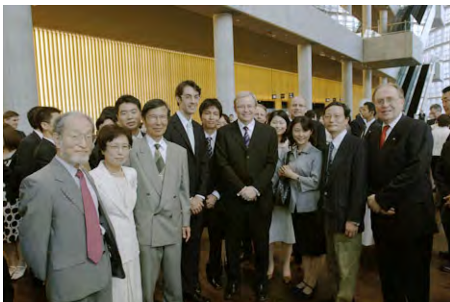
Australian Prime Minister, the Hon Kevin Rudd MP visits the Emily Exhibition at the National Art Centre Tokyo in June 2008.