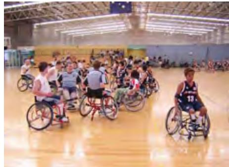
Japan Junior Wheelchair Basketball Team participation in the Day of Difference Junior Games held in Sydney in September-October 2007.