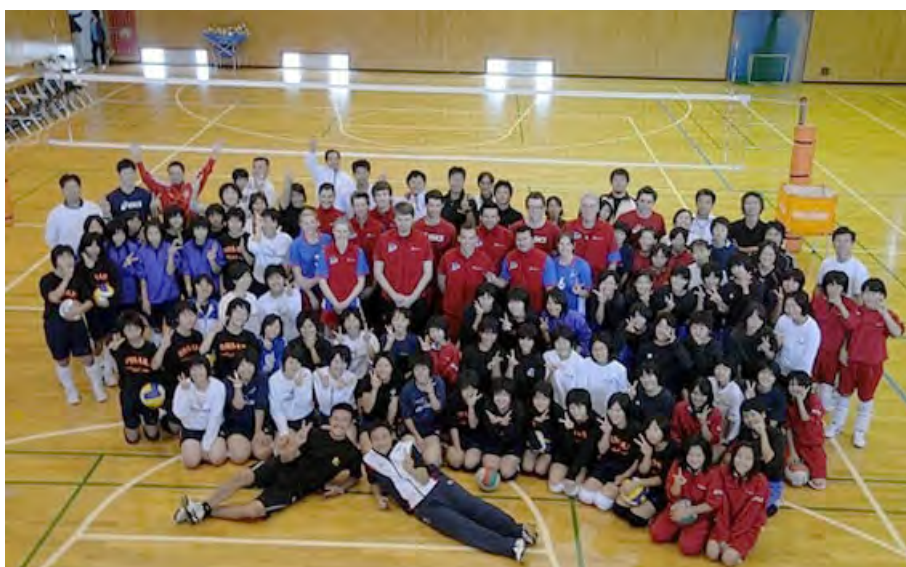
Norwood players at a coaching clinic for local high school children, Hakkai Koku, Japan