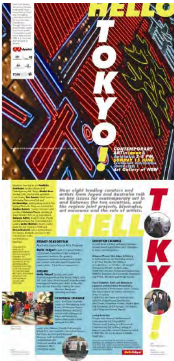
Publicity flyer for the Australia-Japan Arts Forum held in Sydney in June 2008.