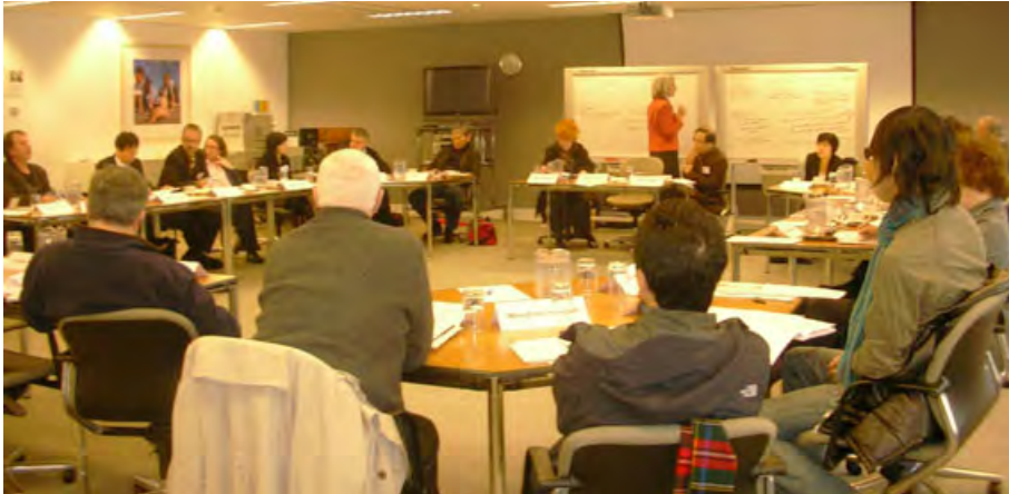
Closed Australia-Japan arts forum held in Sydney in June 2008.