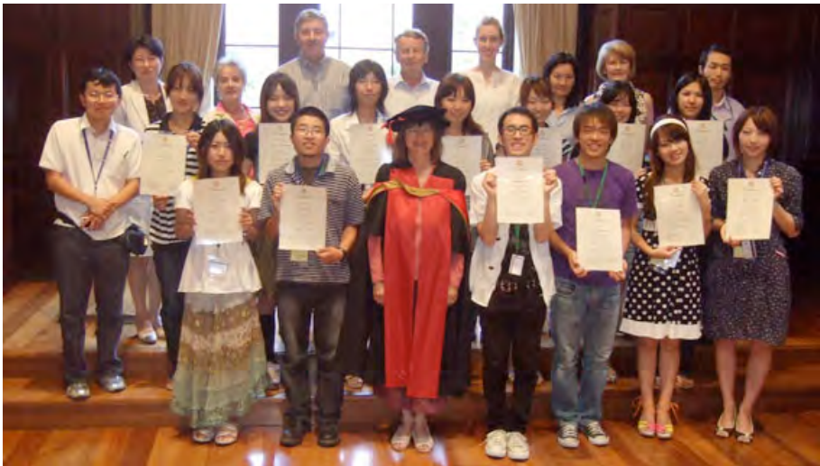
University of Sydney, Australian Studies Summer School, Graduation Ceremony, January 2008.