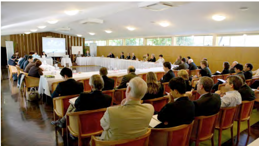
ANU Department of International Relations' workshop on emerging Australia-Japan security cooperation held in Canberra.