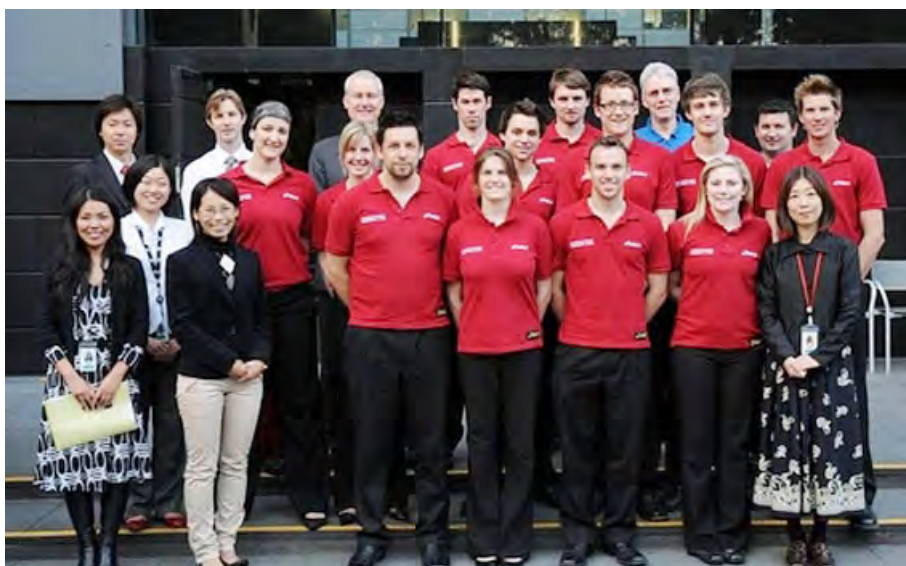
The Norwood Bears received at the Australian Embassy, Tokyo

The Norwood 'Bears' Volleyball Club, 2008 South Australian State League Champions, toured Japan from 7-18 October 2008. The team played a series of matches and participated in numerous cultural and community activities, including a formal exchange with the Japanese club, Neo-Zeon of Muika-machi, and participated in English conversation lessons in a number of Japanese educational institutions, including Hakkai High School and the International University of Japan.