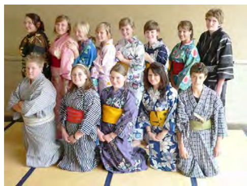
Australian students from Prospect High School in Tasmania visit their Japanese sister school in Tsuga.