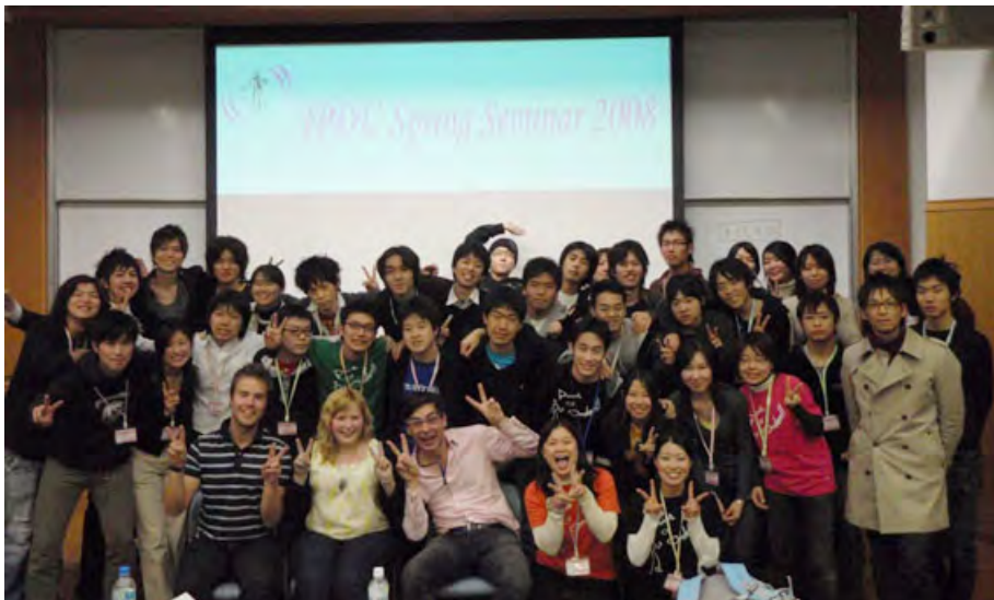
The 2008 Australia-Japan Spring Debaters' Seminar.

The Australia-Japan debate seminars in Japan have been supported by the AJF since 2003. Over this period, the organisations have helped raise debating practice in Japan to a new level and promoted constructive engagement between Australian and Japanese student debaters, adjudicators and coaches. Free Debate Incorporated is an Australian not-for-profit organisation which aims to foster free and fair debate in society with a focus on 'helping the under-privileged, the under-represented and the under-prepared'. The organisation provides debate-related consulting, coaching and facilitation services to needy individuals and organisations, including schools, charities, non-government organisations, community groups, local government and business.