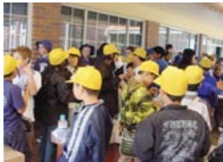
Welcome party for students of Nohara Primary School at Ironside State School in July 2006.