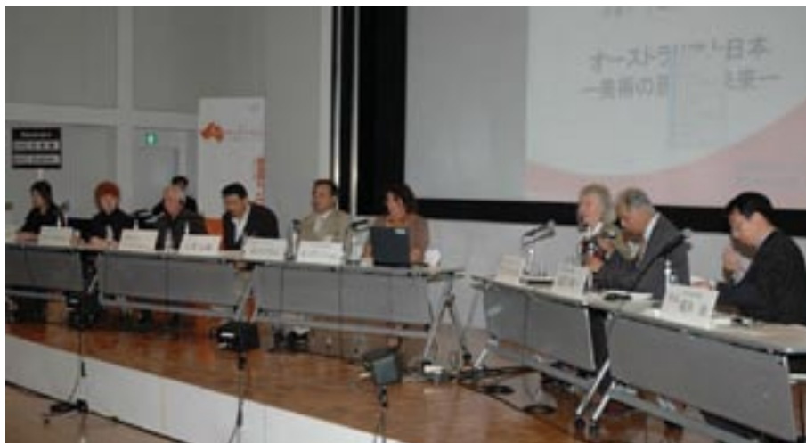
The Australia-Japan Art Forum held at the National Art Centre in Tokyo on 29-30 September 2006.

The highlight of the AsiaLink visual arts program in 2006-07 was the Australia-Japan Art Forum held at the National Art Centre in Tokyo (NACT) on 29-30 September 2006. The forum brought together Australian and Japanese curators, museum directors and artists to discuss approaches for the development of visual arts programs and exchanges between the two countries. A key outcome of the forum was an agreed statement of principles, priorities and recommendations to guide the future development of visual arts exchanges. An associated reception to mark the launch of the Australia Festival, a two week celebration of Australian culture, food and wine and education, was also held at NACT on 29 September 2006. A second forum will be held in Australia in 2008.