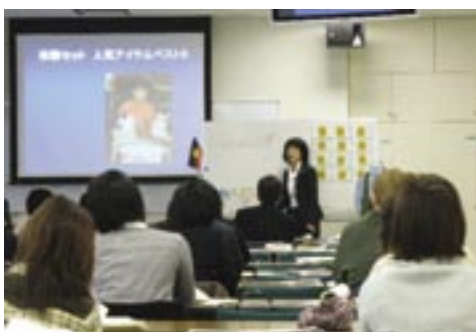
Workshop in Sapporo on 11 January 2007 5 university lecturers, 10 educational institution staff, 25 teachers attended.