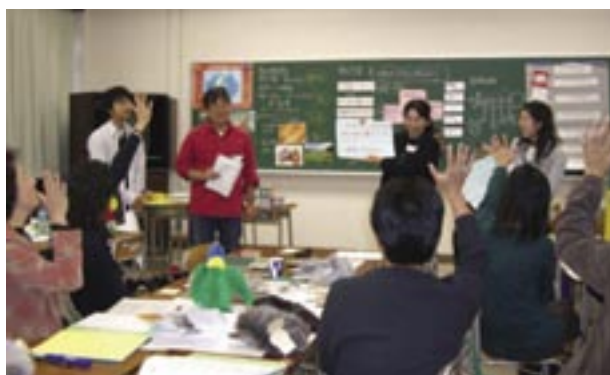
20 Japanese teachers attended the Experience Australia Teacher Development Workshops on 22 October 2006 Group presentation by participants in Miyagi University of Education during sample lesson to introduce Australian culture

Workshops associated with the hand-over of the kits to Japanese educational institutions were held twice in Sapporo and Iwate in January 2007. The workshops and other promotional activity resulted in the hand-over of 60 kits to 32 Boards of Education, schools and universities throughout Japan.