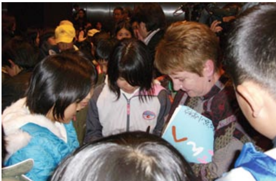
Ms Rodda signs autographs for Japanese fans of her books.

The AJF and the Australian Embassy in Tokyo supported the launch of the ‘Deltora Quest’ - series of fantasy adventure books for children by Australian author, Emily Rodda - as an animation series on Japanese television. The books were first published in Australia in October 2001. The “Deltora Quest” series will be broadcast from TV Aichi throughout the TV Tokyo Network throughout 2007. With over four million copies sold to date, ‘Deltora Quest’ is by far the most successful and widely read Australian book in Japan. Over 100 school children from Koshigaya city (sister city to Campbelltown) attended the preview event which was widely reported in Japanese print and broadcast media news.