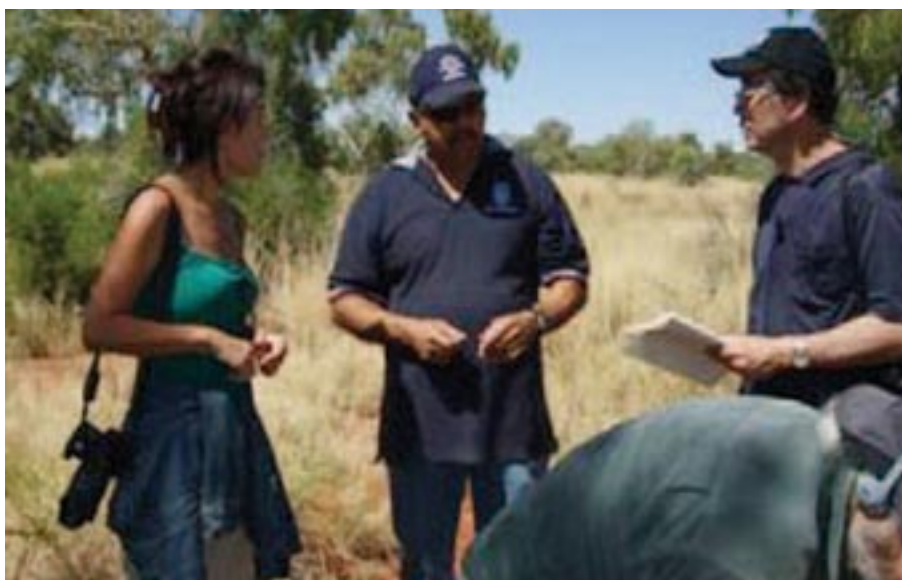
Visiting Japanese delegation in the Northern Territory to research the life and works of Emily Kame Kngwarreye.

The National Museum of Australia (NMA) hosted a research visit to Australia by a Japanese delegation to develop the education component of an exhibition of works by one of Australia's leading Indigenous artist, Emily Kame Kngwarreye. The exhibition will be the first major Kngwarreye solo exhibition ever held outside Australia and is expected to attract widespread attention in Japan and internationally when it opens in Osaka and Tokyo in 2008.