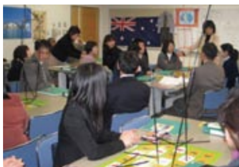
Workshop in Oshu in Iwate prefecture on 24 January 2007, 40 teachers attended. Activity 1: Building of Straw tower without talking