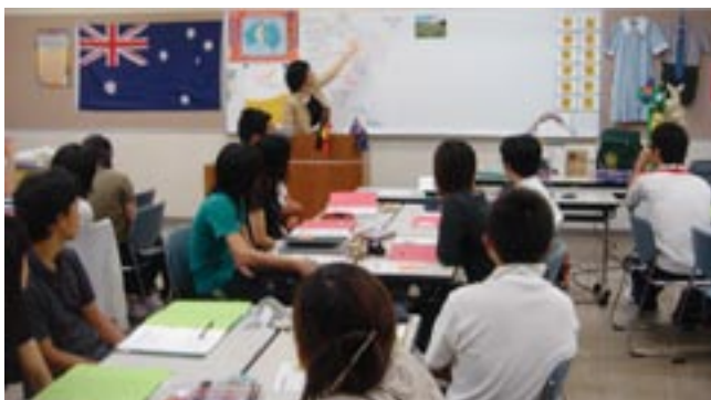
Experience Australia Workshop held in Aichi on 1 August 2006. A total of 27 teachers, one head teacher, and six trainers attended.

An Experience Australia lesson plan competition, award ceremony and networking event for teachers was held in Japan on 21 July 2006. A selection of the best quality lesson plans were compiled into a booklet and distributed to participants. A series of professional teacher development workshops also took place in September 2006. More than 250 teachers participated in the workshops across Japan, including in Sendai, Miyagi prefecture and at the Educational Solution Fair at Akihabara in Tokyo in conjunction with workshops on the Discover Eco Australia program. Other workshops were held in the Aichi Prefecture (organised by Mito Education Board), Kyoto City (organised by the Kyoto Education Centre), Okayama Prefecture (organised by Okayama and Kurashiki Education Boards), and at the Kagoshima International Centre - the first AJF workshop to take place in the Kyushu area.