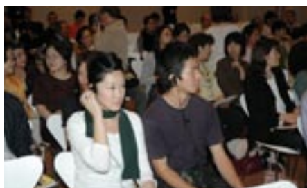
A public symposium held on Day 2 attracted a capacity audience.