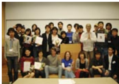
JPDU Committee members with visiting Australian debate instructors.