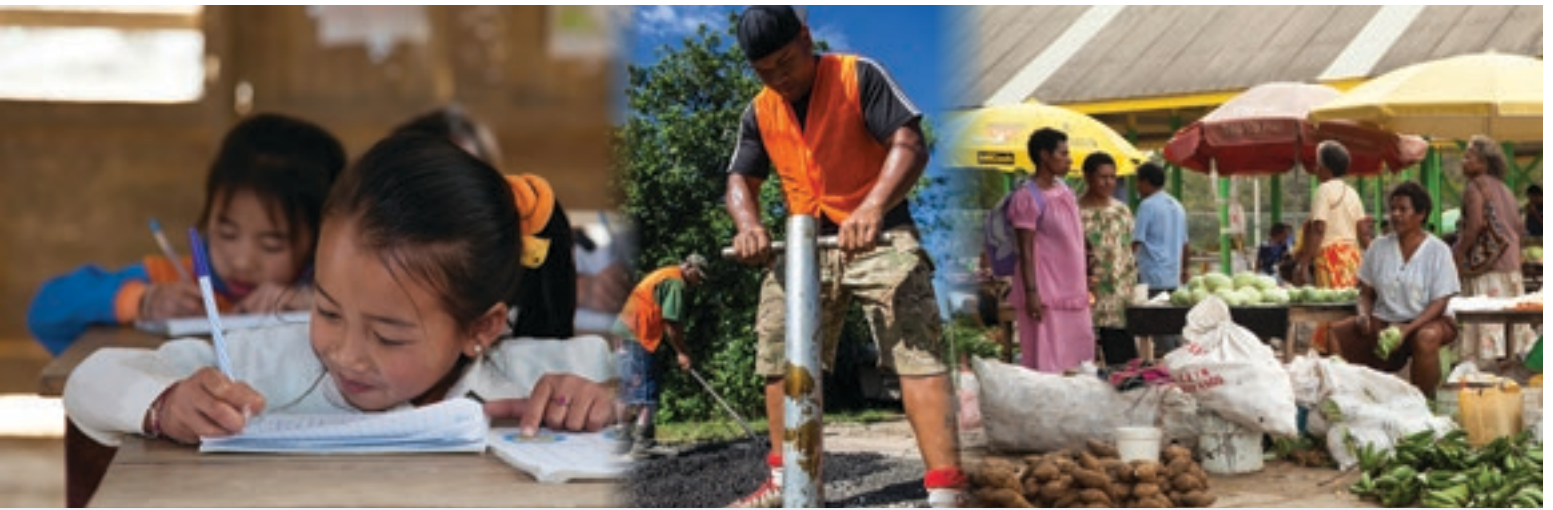
From left to right: Pupils at Namone Primary School, Xieng Khouang Province, Lao PDR.; Road repairs in Tongaputu, Tonga.; Gerehu Market, Papua New Guinea, where women and children make up the majority of the market.