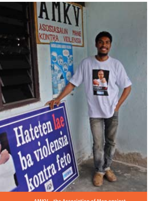
AMKV—the Association of Men against Violence—is active in engaging men in ending violence against women and working with the community to promote gender equality.

Women have strong representation in the National Parliament in East Timor. Further strengthening women's participation in economic, social and political life in East Timor will assist in changing community attitudes to and preventing violence against women.