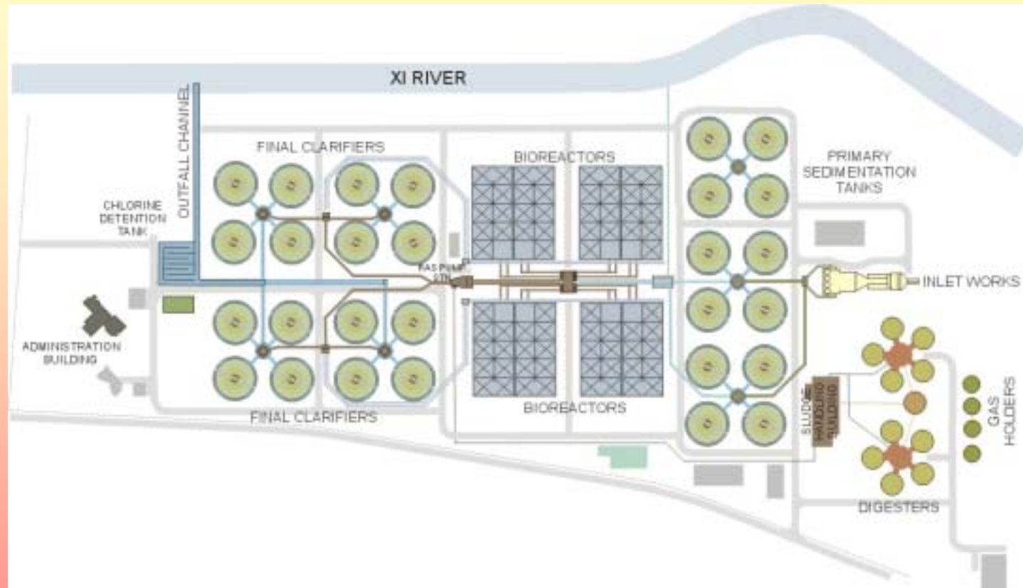
Shenyang Western Wastewater Treatment Plant Capacity : 800 tons/day Liaoning Province