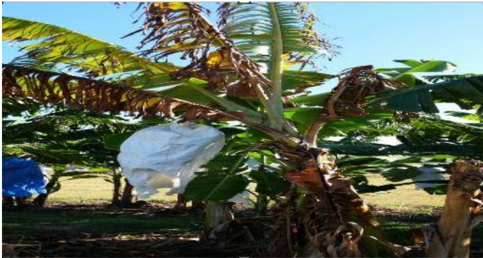
Symptoms of Fusarium wilt TR4 on a Cavendish banana plant growing in the Northern Territory, July 2019

Grantee: Queensland University of Technology