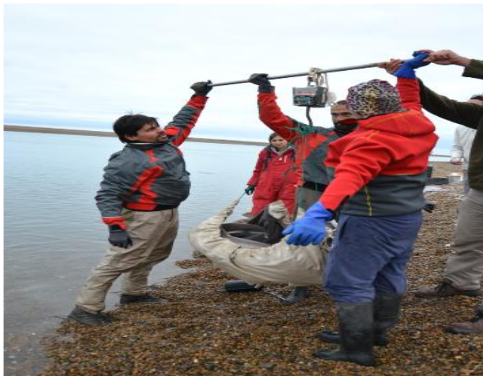
Weighing aquatic wildlife in Patagonia

Grantee: Centro Nacional Patagonico (CENPAT) – Consejo Nacional de Investigaciones Científicas y Técnicas (CONICET)