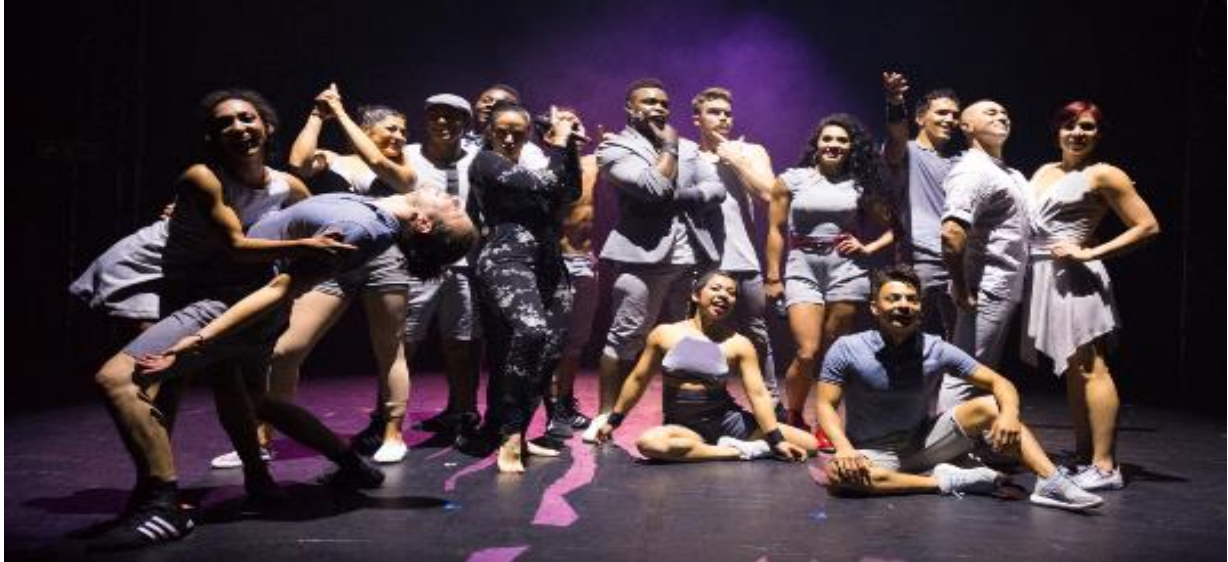
Cast photo - Circolombia's "Acelere"

Grantee: Arts Projects Australia Events Pty Ltd