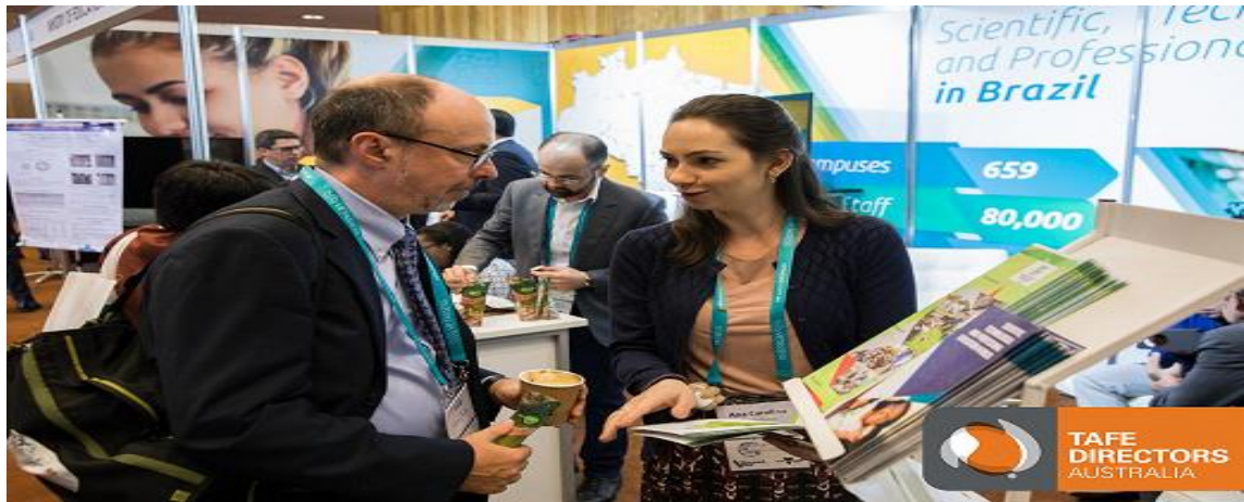
2018 World Congress, Melbourne, Brazilian TVET Providers talking to Australian delegates