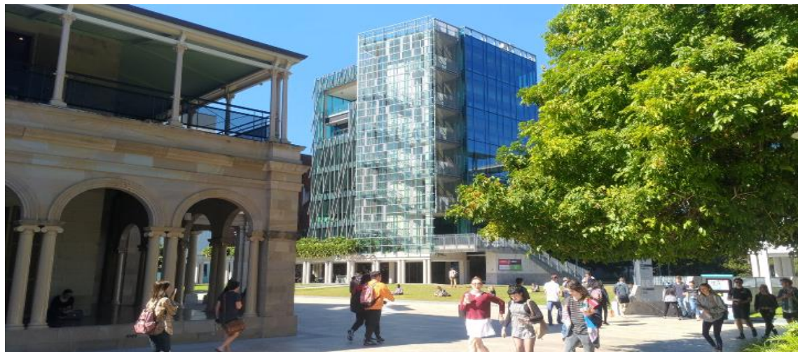
A Snapshot from the Smart Precinct of Queensland University of Technology

Grantee: Queensland University of Technology