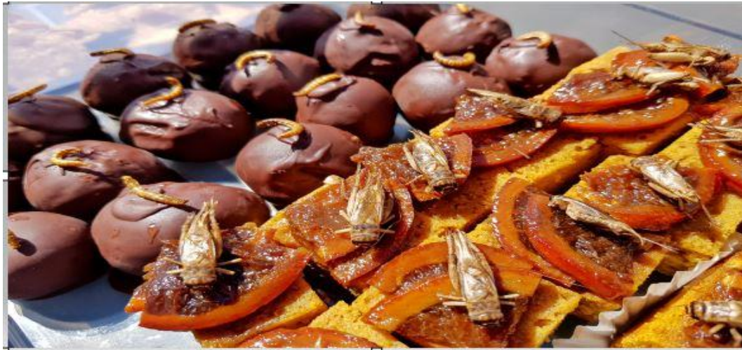
Edible Insects Grilo Spread_crickets and _mealworms