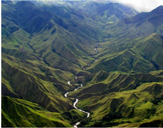
PNG-Australia Governance Partnership