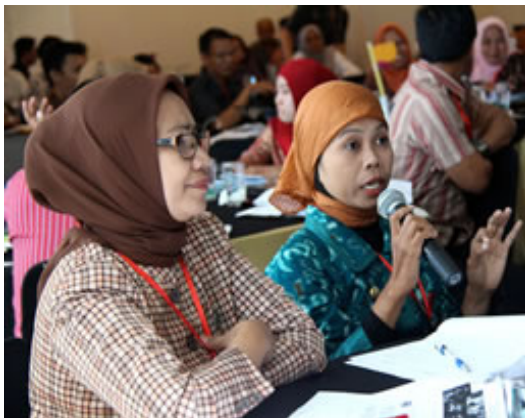
MAMPU, Empowering Women for Poverty Reduction, Indonesia