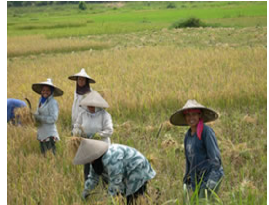
KOMPAK, Governance for Growth, Indonesia