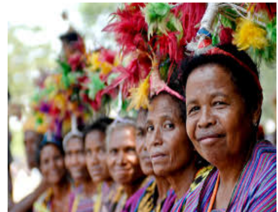
Partnership for Human Development, Timor Leste