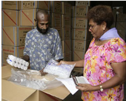
Health and HIV Implementation Services Program, PNG