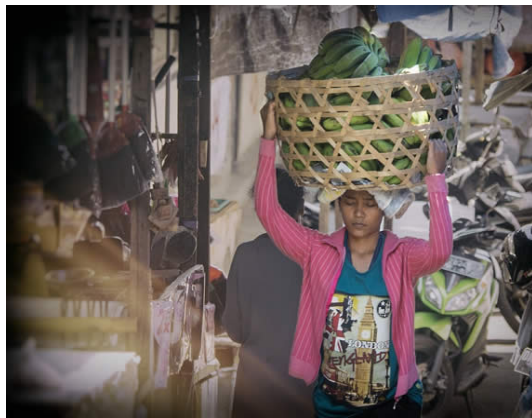
Investing in Women, South East Asia